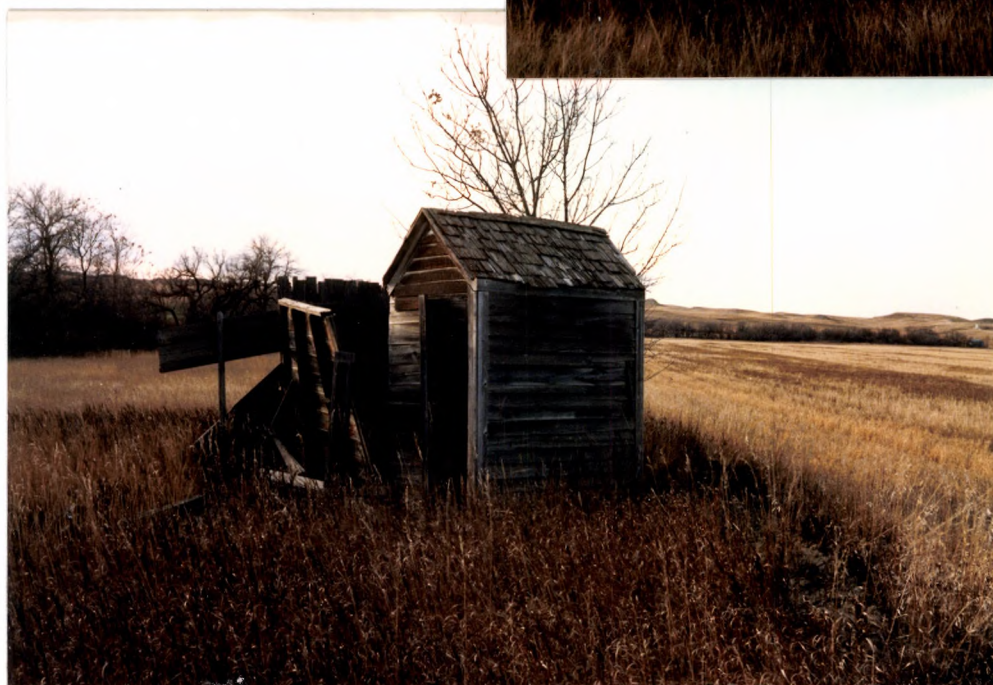
Appendix 2. Photographic coverage of Site #1038-2. Legal: SE \frac{1}{4} SE \frac{1}{4} NE \frac{1}{4} , Section 29, T149N, R104W, McKenzie County, ND. Top photo taken facing northwest of Feature 1, middle photo taken facing southeast of Feature 1, and bottom photo facing northwest of Feature 2. U-W#1038. Field Date: October 27, 1987.