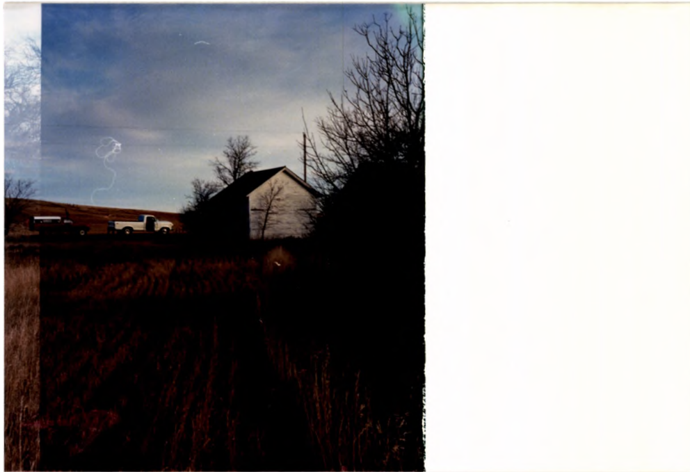
Appendix 2 concluded. Top photo taken facing southeast of Feature 2, and bottom photo site overview facing east/southeast.