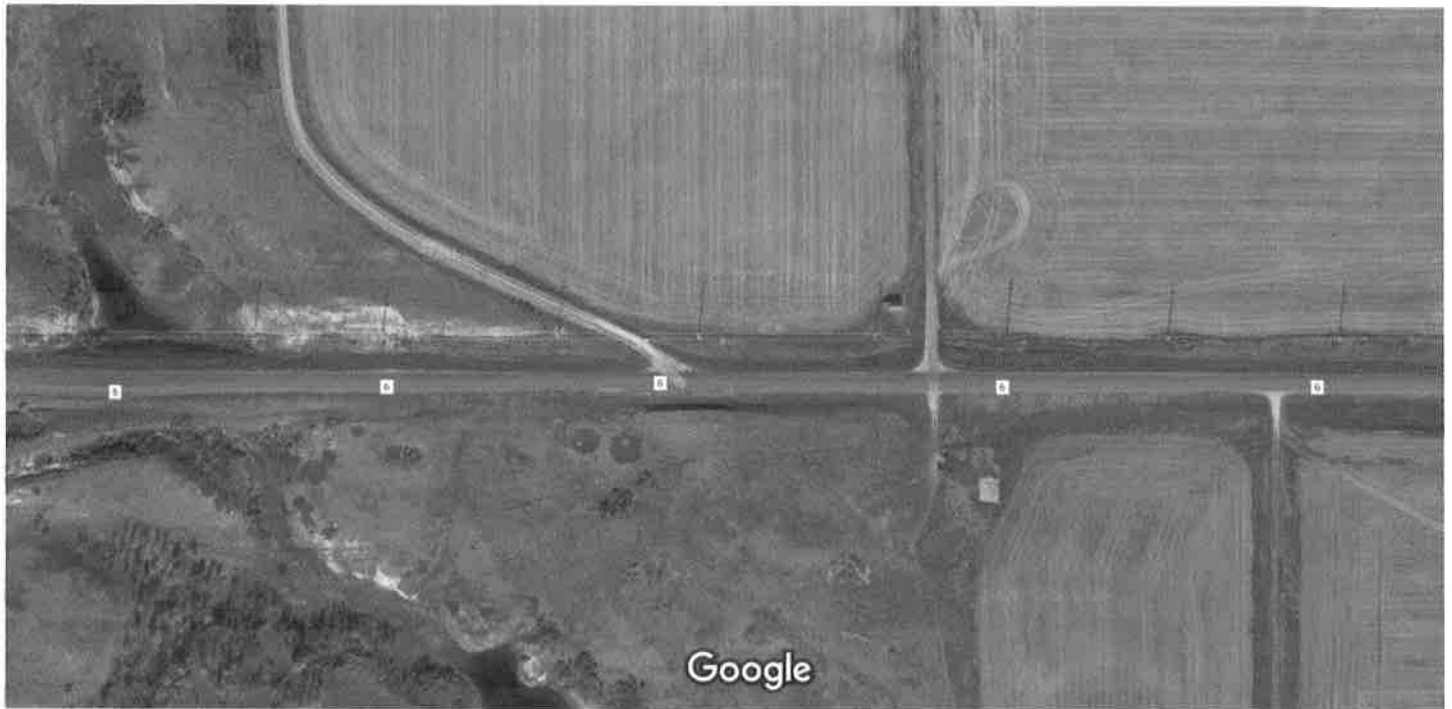
Imagery ©2020 Maxar Technologies, USDA Farm Service Agency, Map data ©2020 200 ft