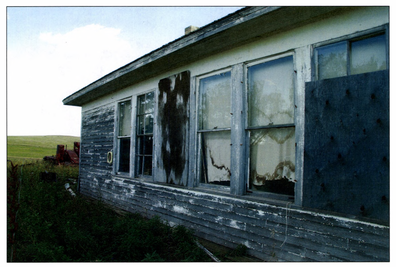
Figure 4. Rhoades School, north elevation (originally east).

Complete one Attachments Section for the entire site. Include: Topographic map (with <u>quad name</u> and <u>legal description</u>), sketch map, photographs, and any other attachments.