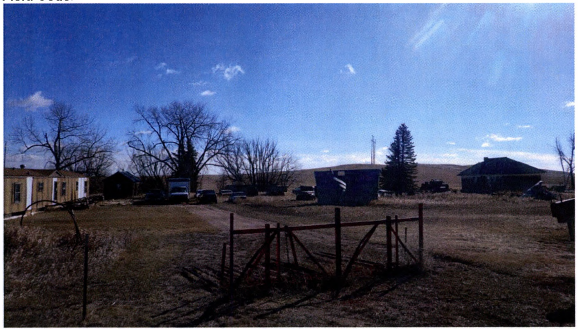
Figure 2: Overview site 32MZ2148, view southeast (Image #2786).