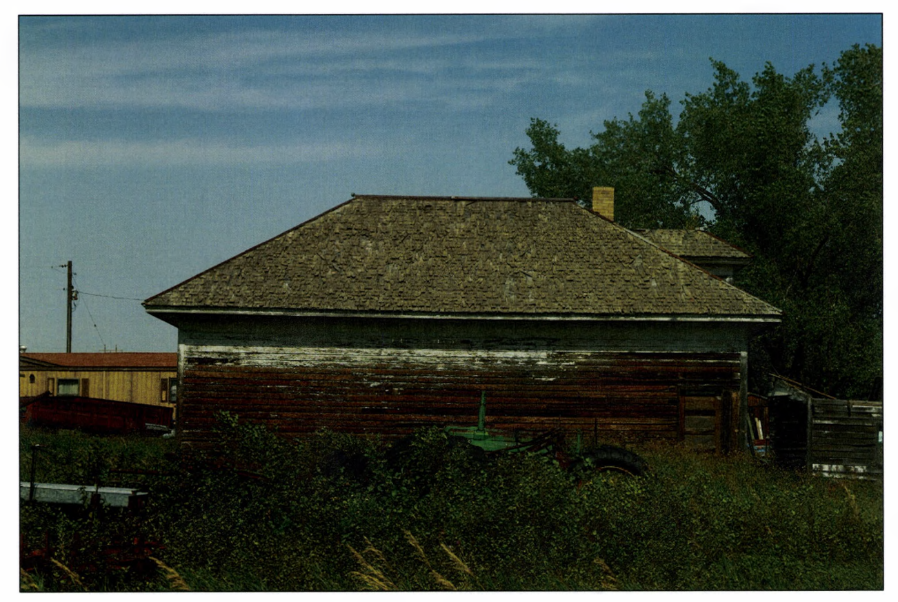
Figure 2. Rhoades School, north elevation (originally west).

Complete one Attachments Section for the entire site. Include: Topographic map (with <u>quad name</u> and <u>legal description</u>), sketch map, photographs, and any other attachments.