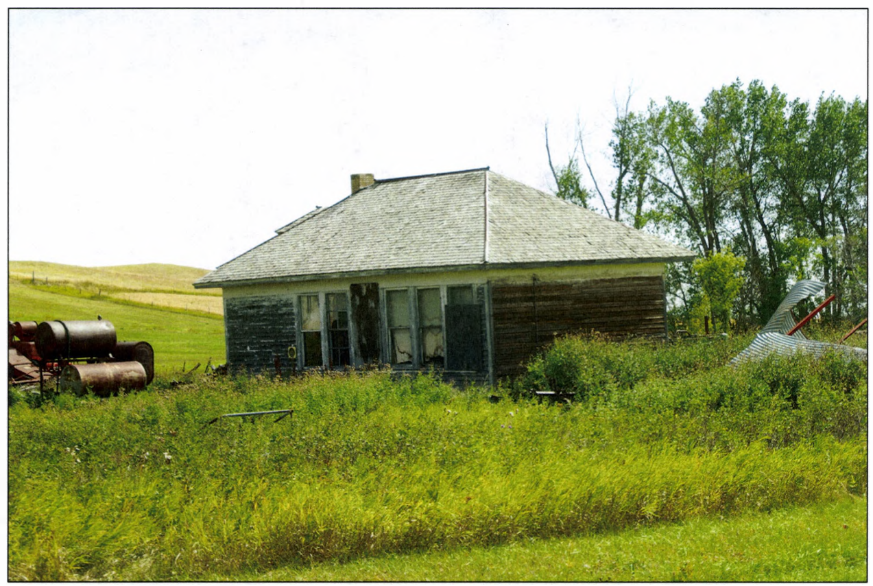
Figure 3. Rhoades School, north and west elevation (originally east and north).

Complete one Attachments Section for the entire site. Include: Topographic map (with <u>quad name</u> and legal description), sketch map, photographs, and any other attachments.