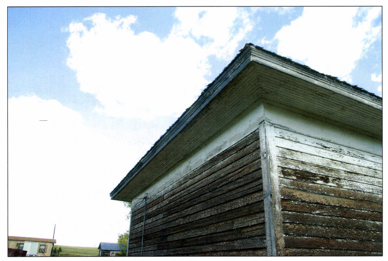
Figure 5. Rhoades School, southwest corner (originally northwest).

Complete one Attachments Section for the entire site. Include: Topographic map (with <u>quad name</u> and legal description), sketch map, photographs, and any other attachments.