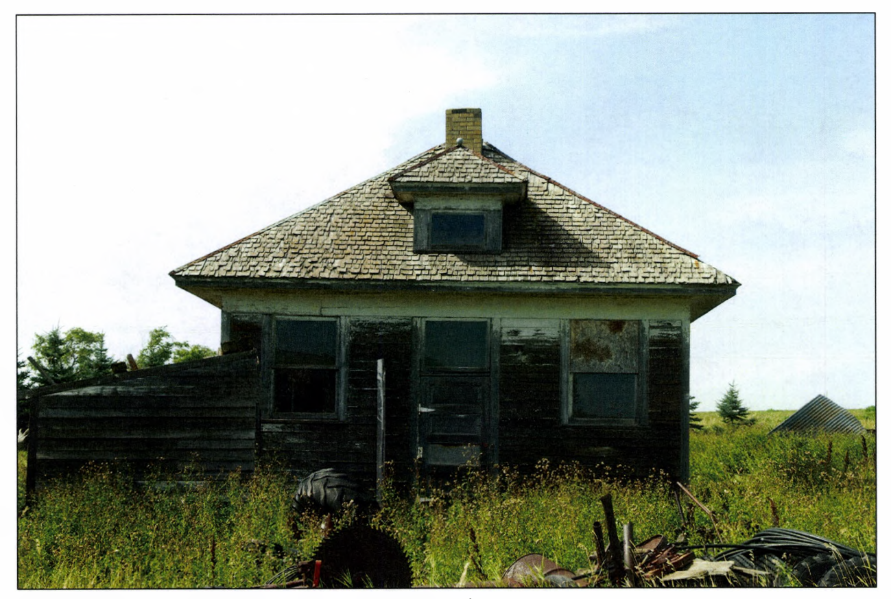
Figure 1. Rhoades School, east elevation (originally south).

Complete one Attachments Section for the entire site. Include: Topographic map (with <u>quad name</u> and <u>legal description</u>), sketch map, photographs, and any other attachments.