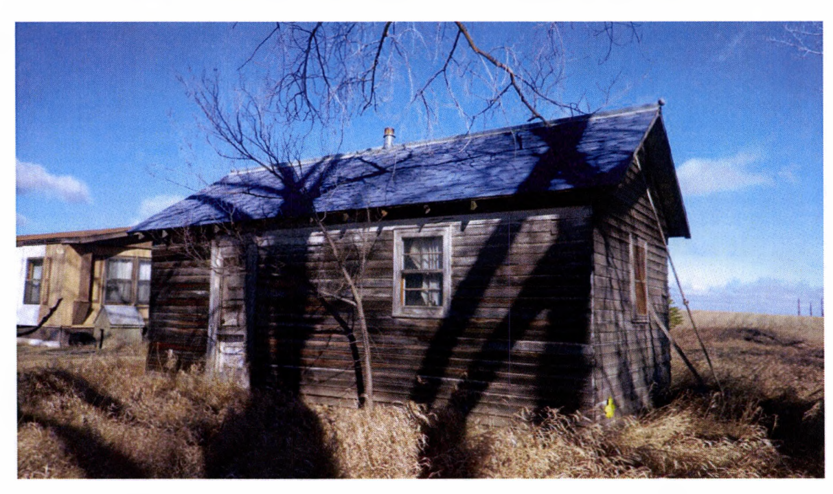
Figure 5: Site 32MZ2148, Feature 2, view northwest (Image #2784).