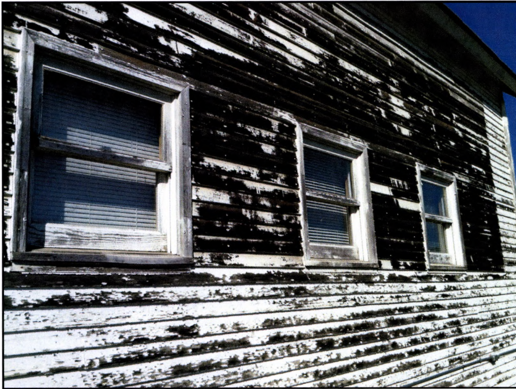
Figure 7: Close up of windows and infill along south elevation of town hall.