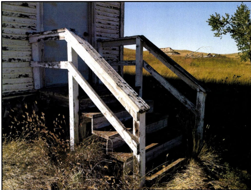
Figure 8: Detail of stairway along east elevation of town hall.

Recorded By Tim Goggin (First Name & Last Name)