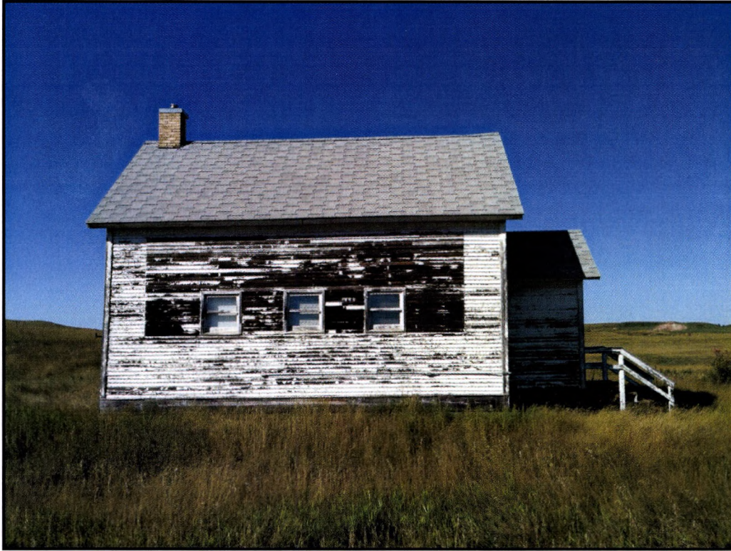
Figure 3: South elevation of town hall at JUP-MKRWD-202.