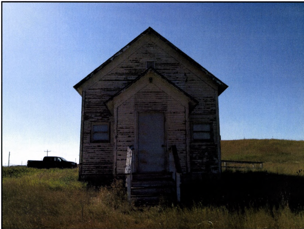
Figure 4: East elevation of town hall at JUP-MKRWD-202.

Recorded By Tim Goggin (First Name & Last Name)