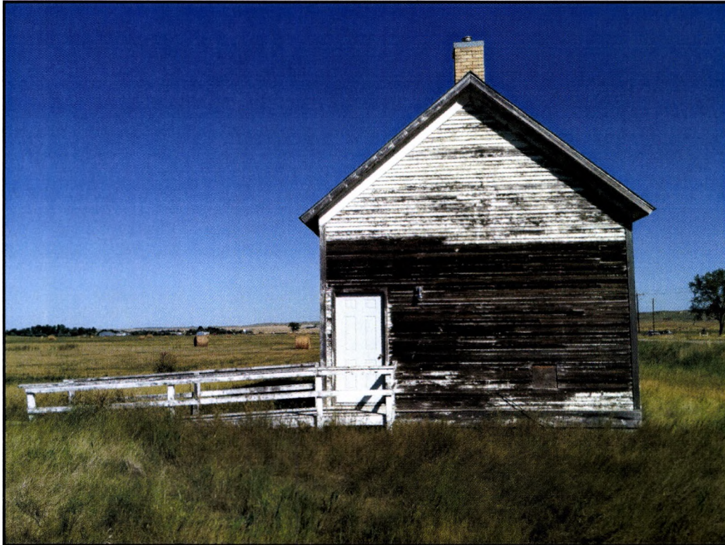
Figure 5: West elevation of the town hall at JUP-MKRWD-202.