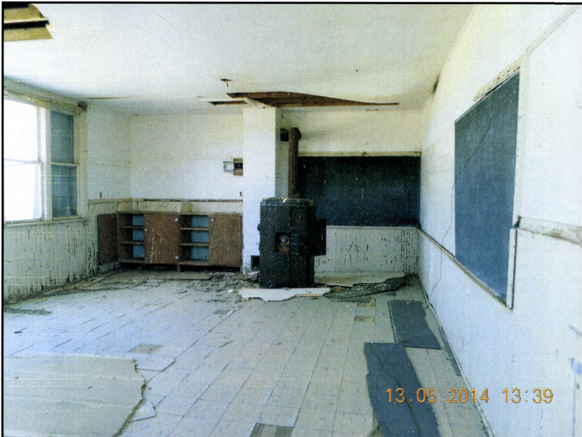
Figure 9: Overview of the interior of Feature 1, facing east.

Recorded By Kaelyn M. Olson (First Name & Last Name)