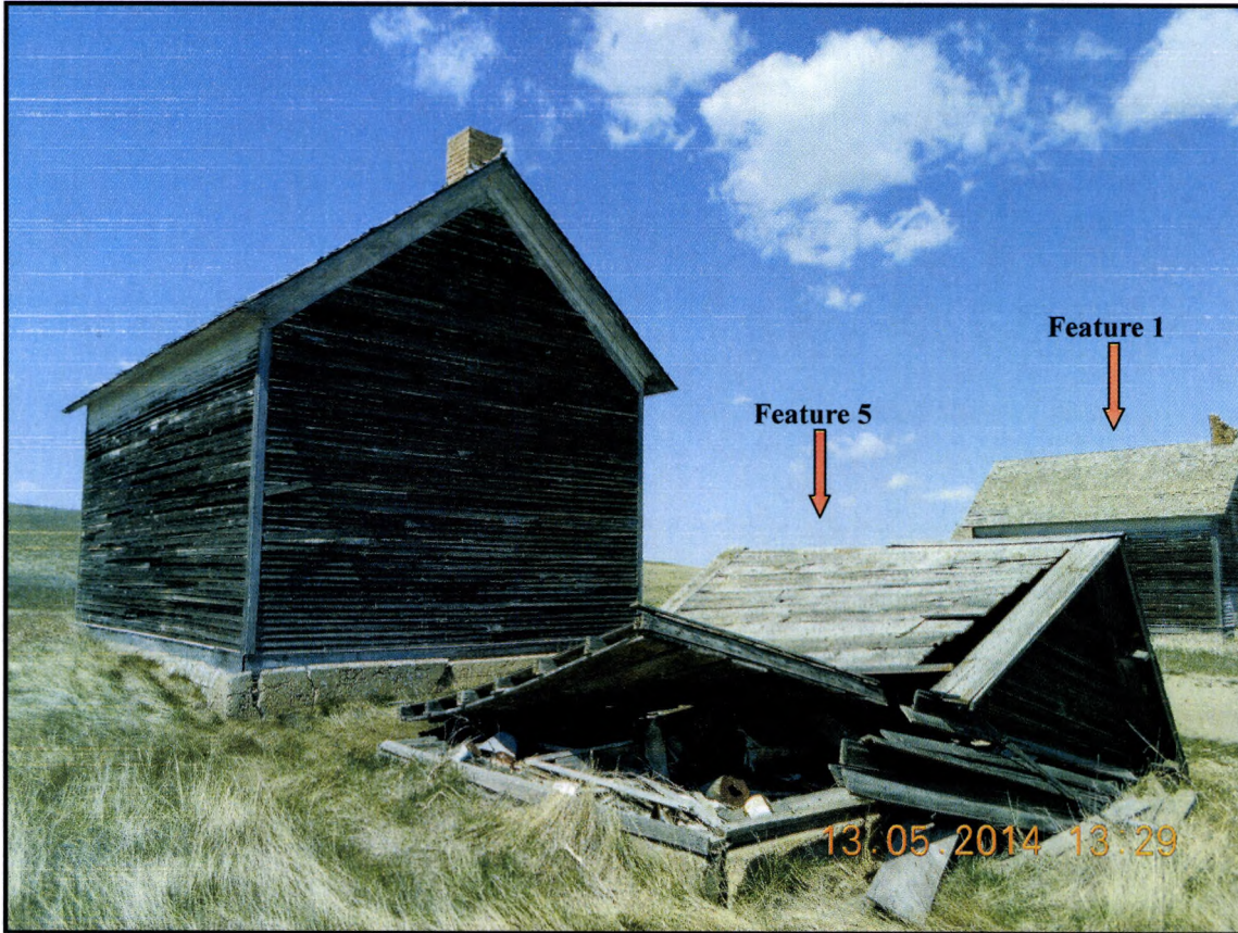
Figure 12: Overview of Feature 2, facing the eastern elevation.