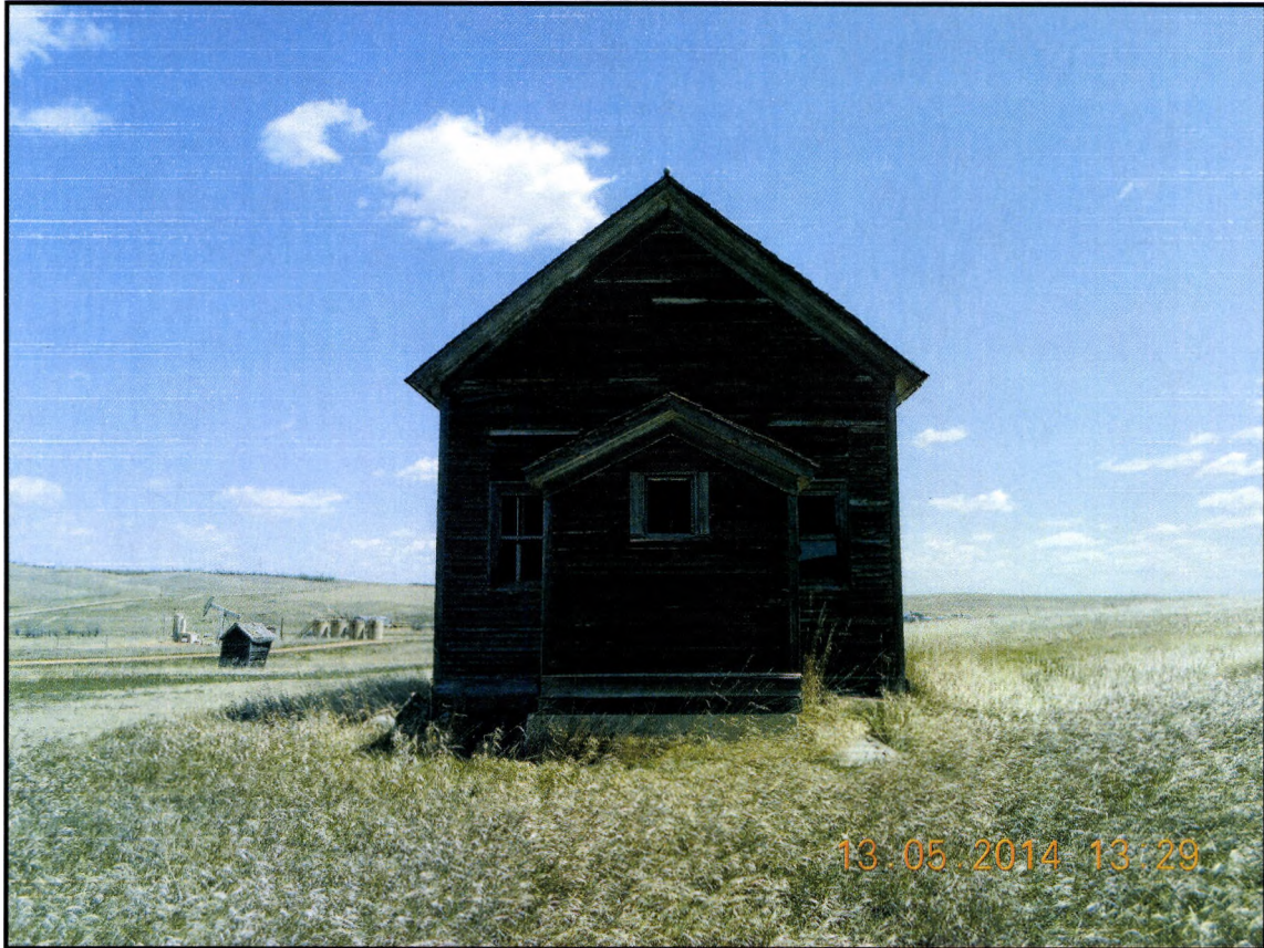
Figure 10: Overview of Feature 2, the residence, facing the western elevation.