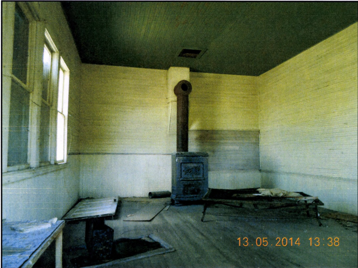
Figure 14: Overview of the interior of Feature 2. Of note are the stove and the metal bed frame.