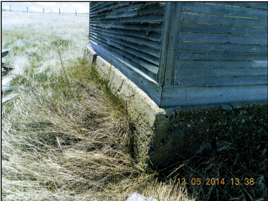
Figure 15: Close up view of the historic concrete foundation of Feature 2. The poorly sorted gravel of the concrete is consistent with Features 1, 2, and 5.

Recorded By Kaelyn M. Olson (First Name & Last Name)