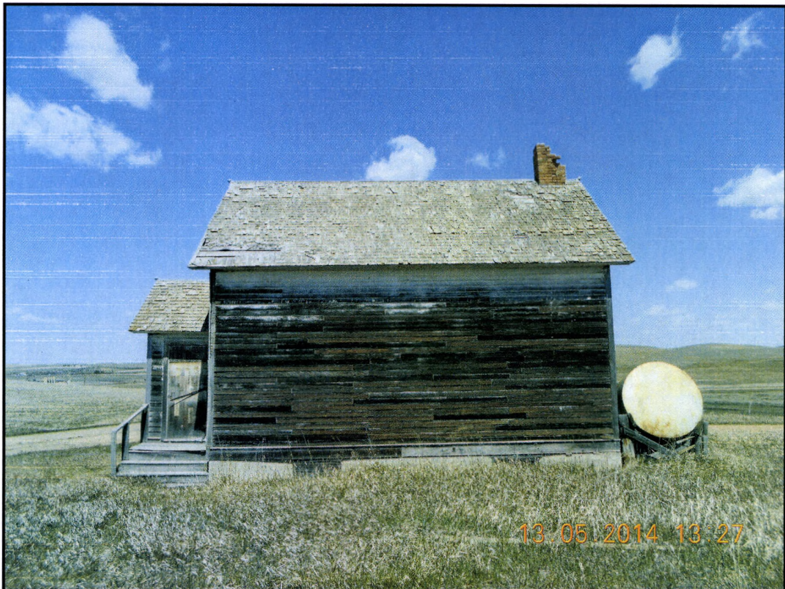
Figure 5: Overview of Feature 1 facing the southern elevation.

Recorded By Kaelyn M. Olson (First Name & Last Name)