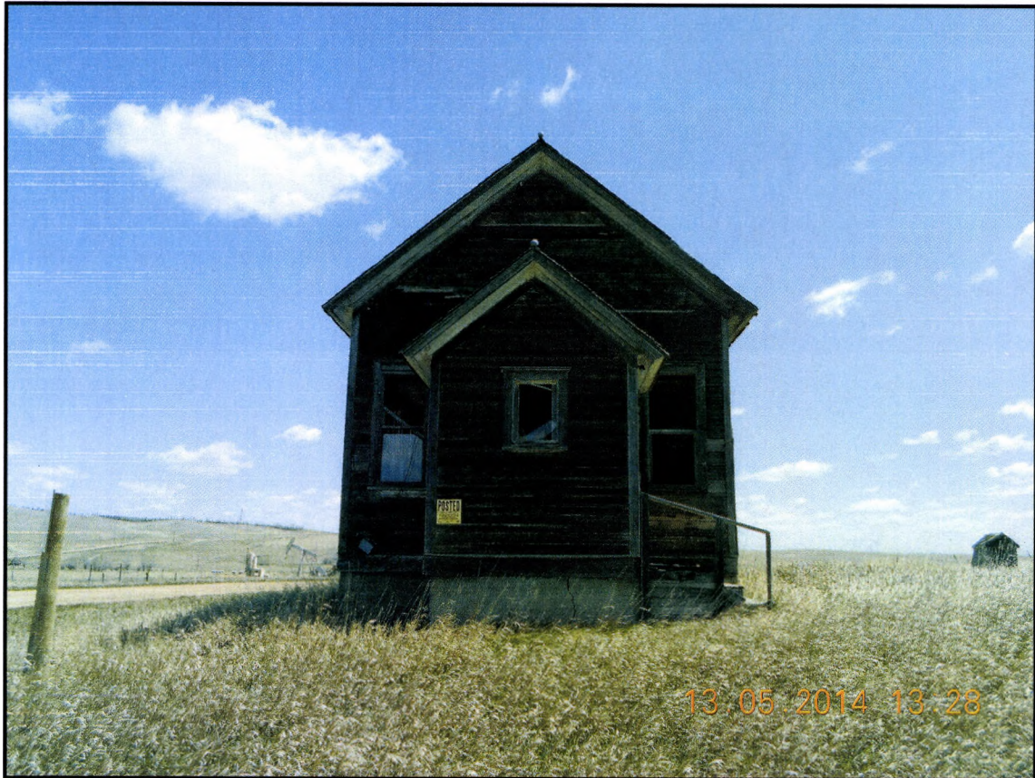
Figure 4: Overview of Feature 1, the schoolhouse, facing the western elevation and the entryway.