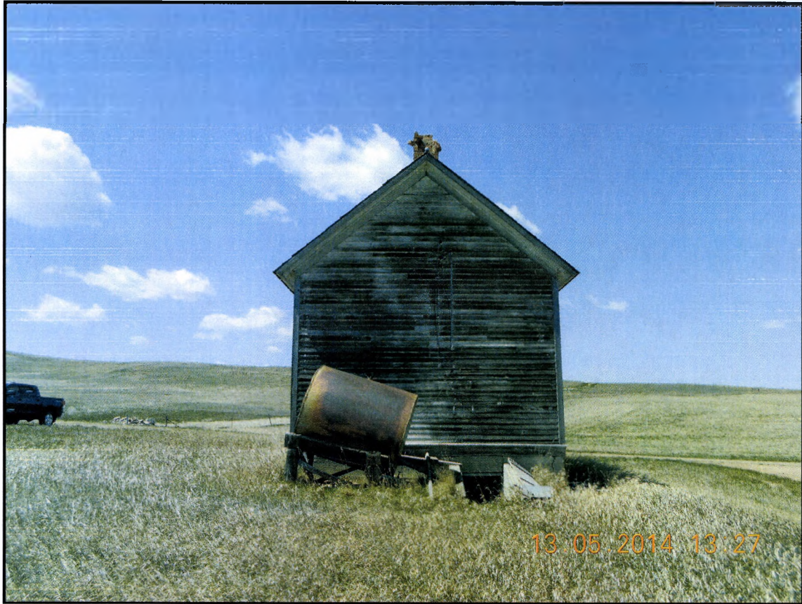
Figure 6: Overview of Feature 1 facing the eastern elevation, including the metal tank, the cellar entrance, and the electrical wiring.