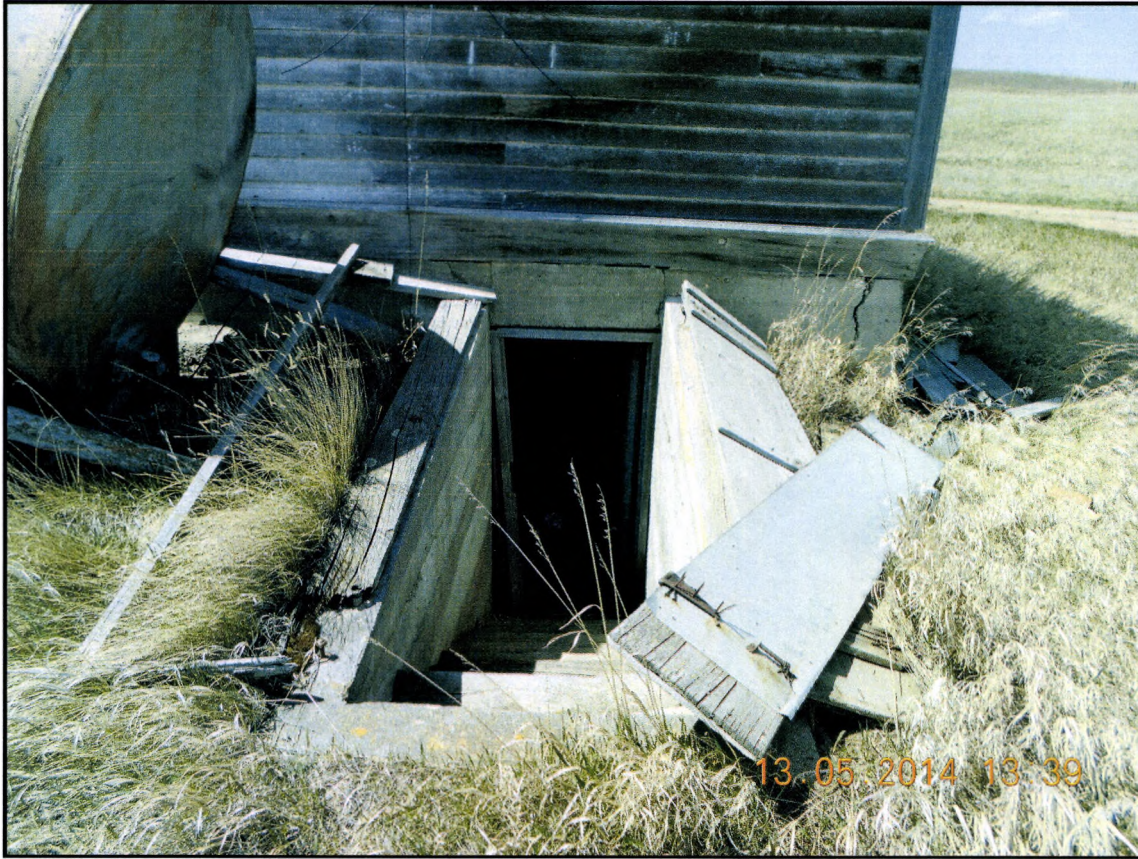
Figure 8: Close up of the cellar entrance of Feature 1.