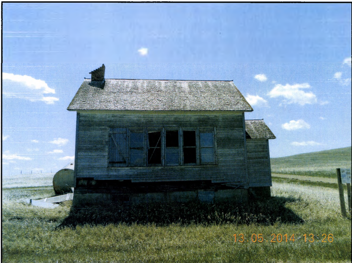
Figure 7: Overview of Feature 1 facing the northern elevation.

Recorded By Kaelyn M. Olson (First Name & Last Name)