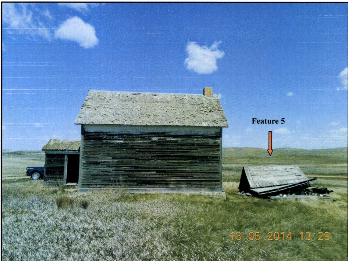
Figure 11: Overview of Feature 2 facing the southern elevation. Feature 5, the collapsed shed, is visible on the right.

Recorded By Kaelyn M. Olson (First Name & Last Name)