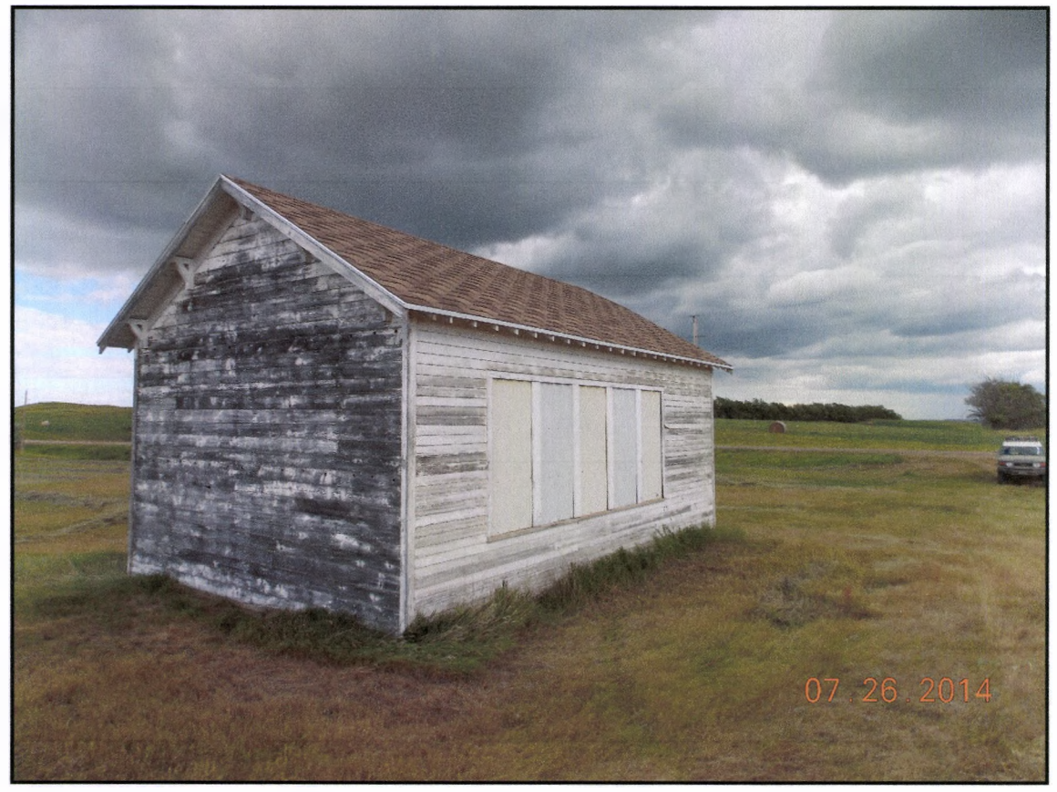
Figure 5: Overview of the schoolhouse, facing northeast.