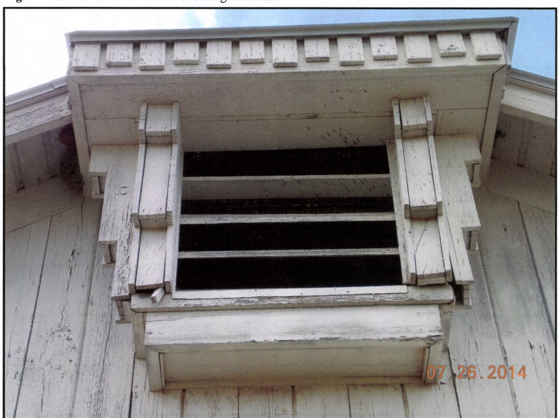
Figure 7: Close up the ventilation window below the hip and above the entrance to the schoolhouse. Review by Bleier in 2016 indicated that this type of vent is relatively unique.