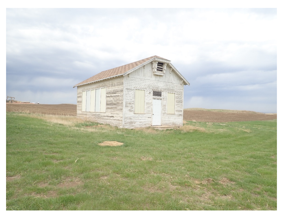
Figure 2. Site 32MZ3004, facing northwest.