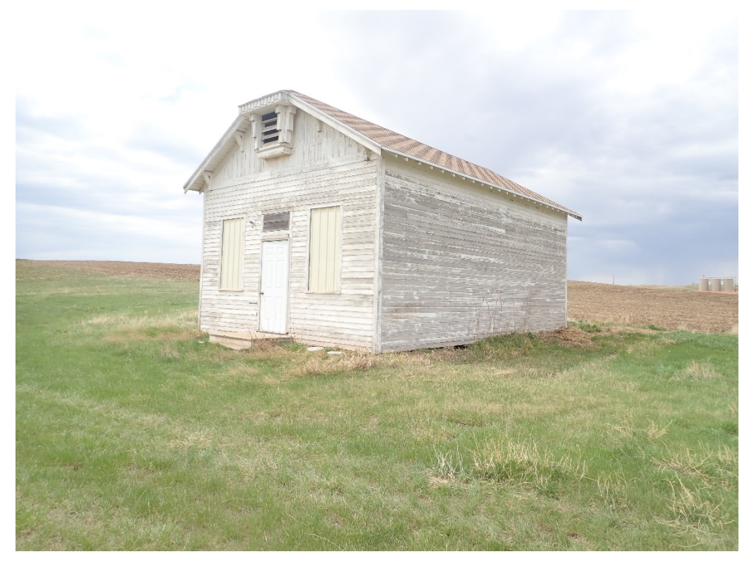
Figure 4. Site 32MZ3004, facing southwest.