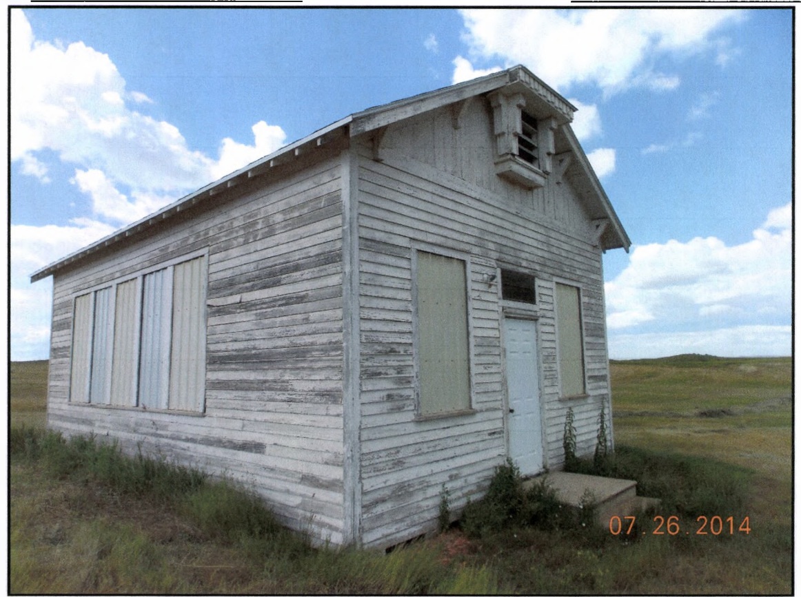
Figure 4: Overview of structure facing northwest. The decorated vent and the hip of the roof noted by Amy Bleier in 2016 are in the foreground.