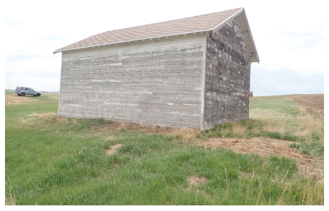
Figure 3. Site 32MZ3004, facing southeast.