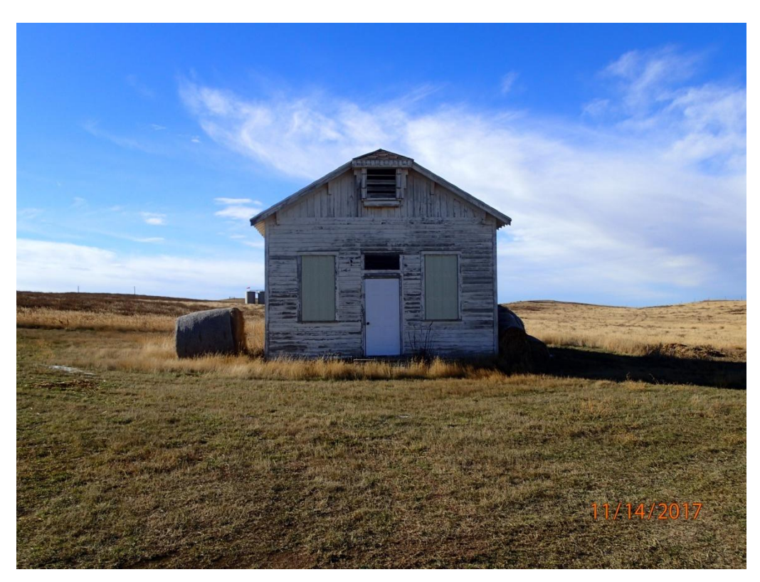
Figure 2: Site 32MZ3004 overview, looking to the west.