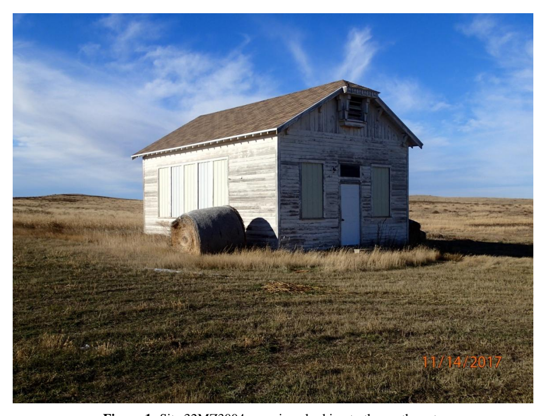
Figure 1: Site 32MZ3004 overview, looking to the northwest.

During the current inventory, no significant change was noted. Site 32MZ3004 is still recommended as unevaluated for the NRHP, as further work is necessary to understand the site's potential eligibility.