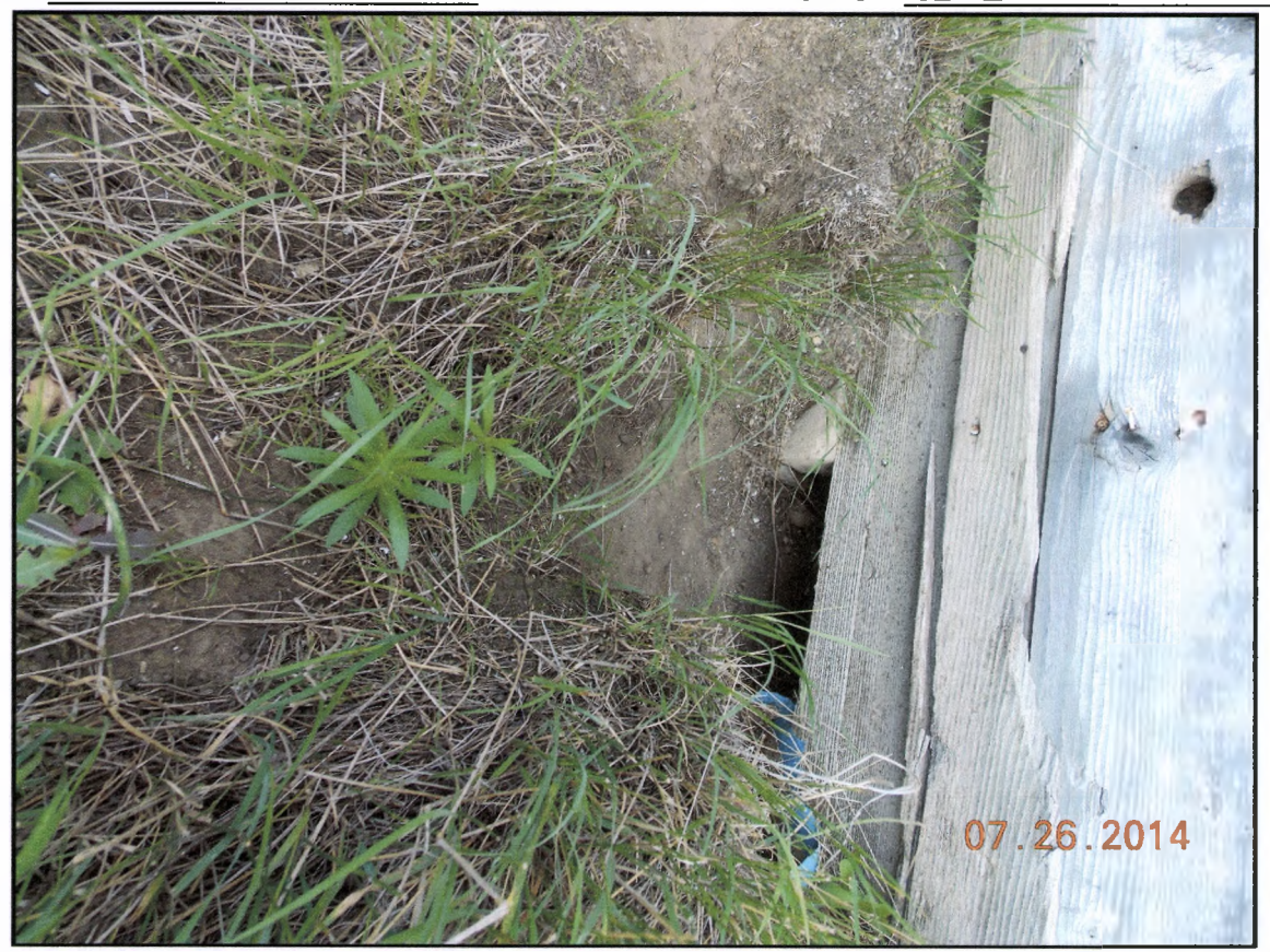
Figure 10: Close up of the stone and concrete footings for the structure.