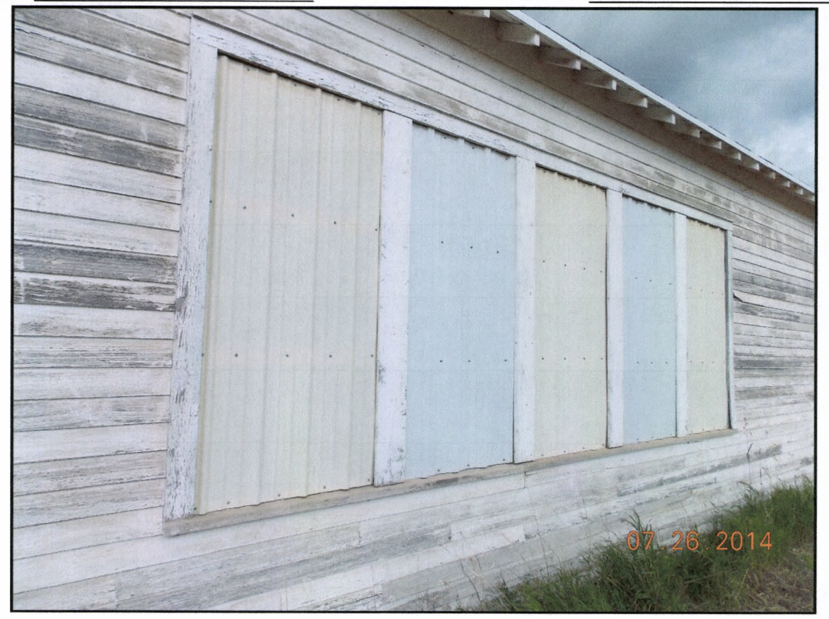
Figure 8: Close up of the south wall and the five windows, now containing sheet metal, that form one continuous portal.

Field Code: <u>JUP-WAWSP-104</u> SITS#: <u>32MZ</u>