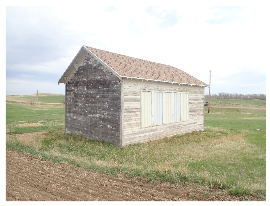
Figure 1. Site 32MZ3004, facing northeast.