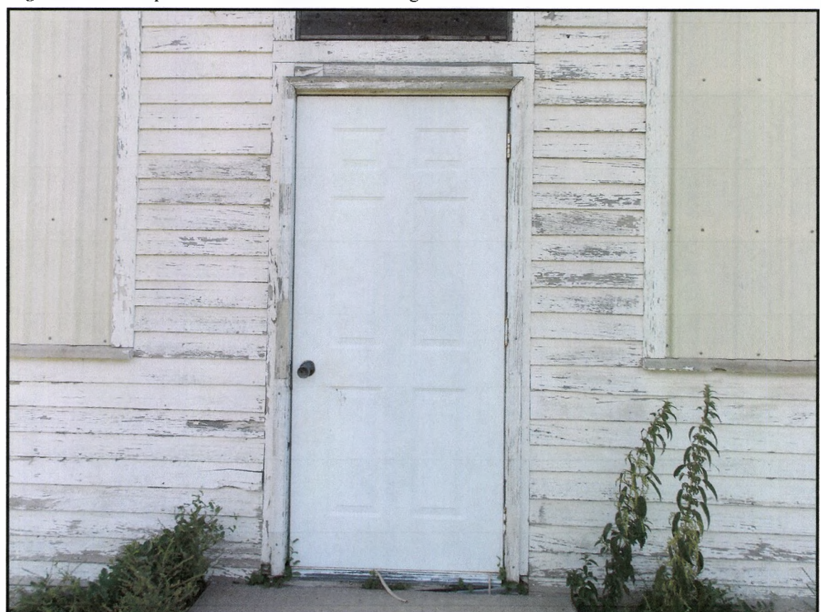
Figure 11: Close up of the main entrance (east side) showing that the door appears to have been painted or replaced recently, and two replaced windows.

Recorded By Chris Rohe (First Name & Last Name)