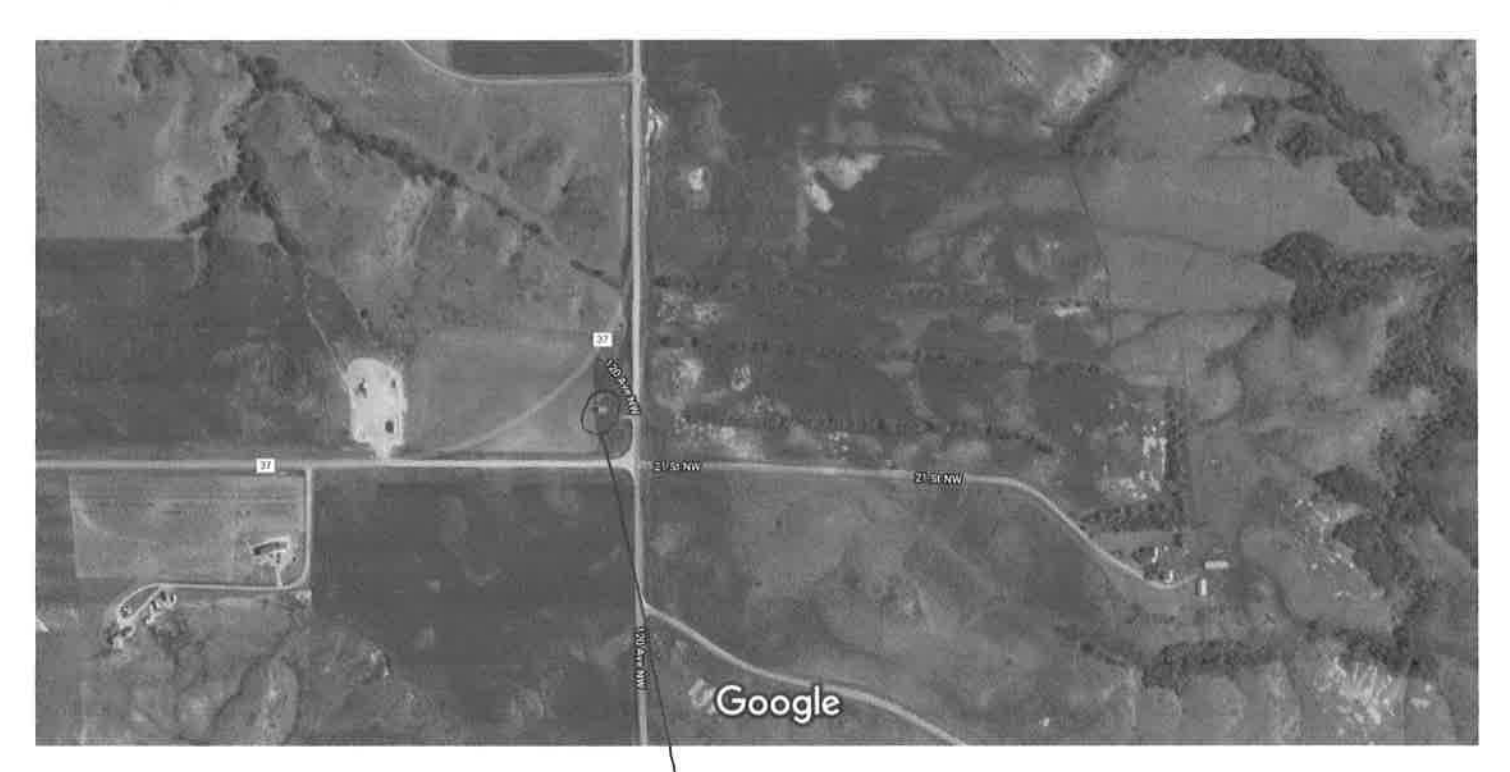
500 ft