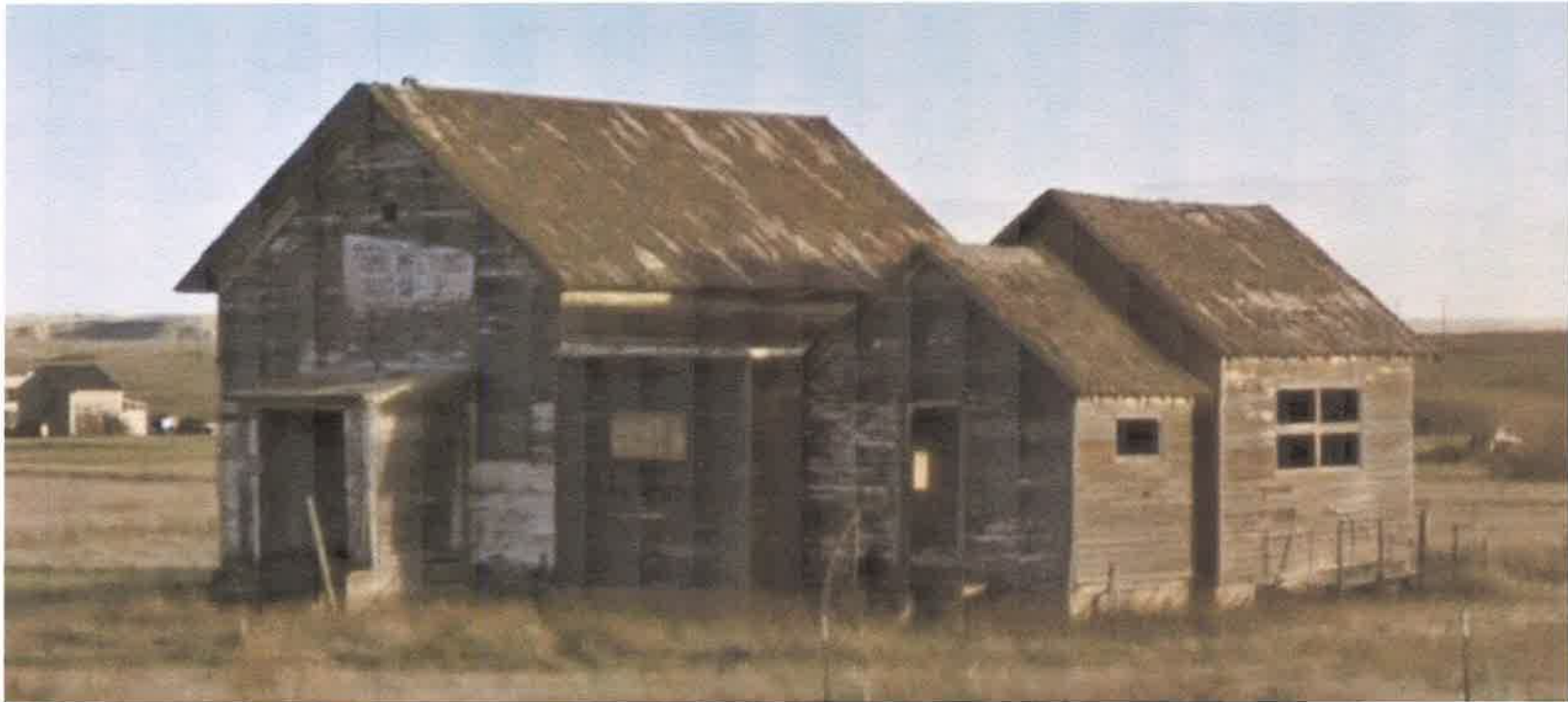
Google Earth Image captured October 2015 shows previous structures and exterior.