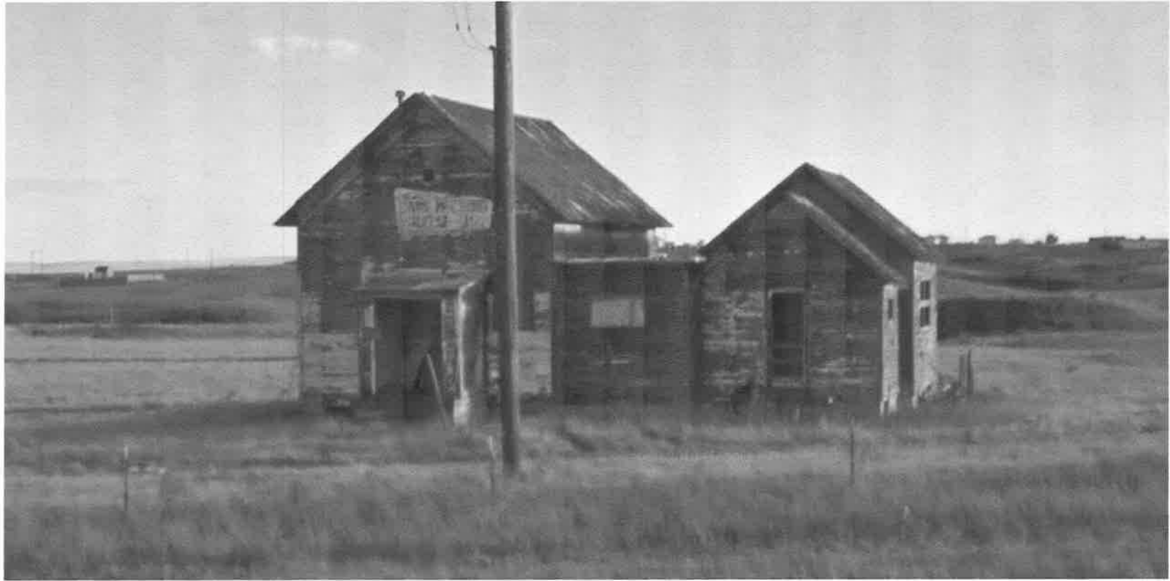
Google Earth Image captured October 2015 shows previous structures and exterior.