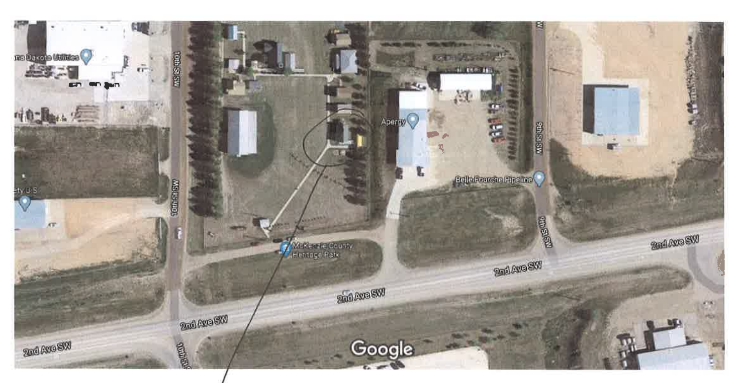
Imagery ©2020 Maxar Technologies, USDA Farm Service Agency, Map data ©2020 100 ft