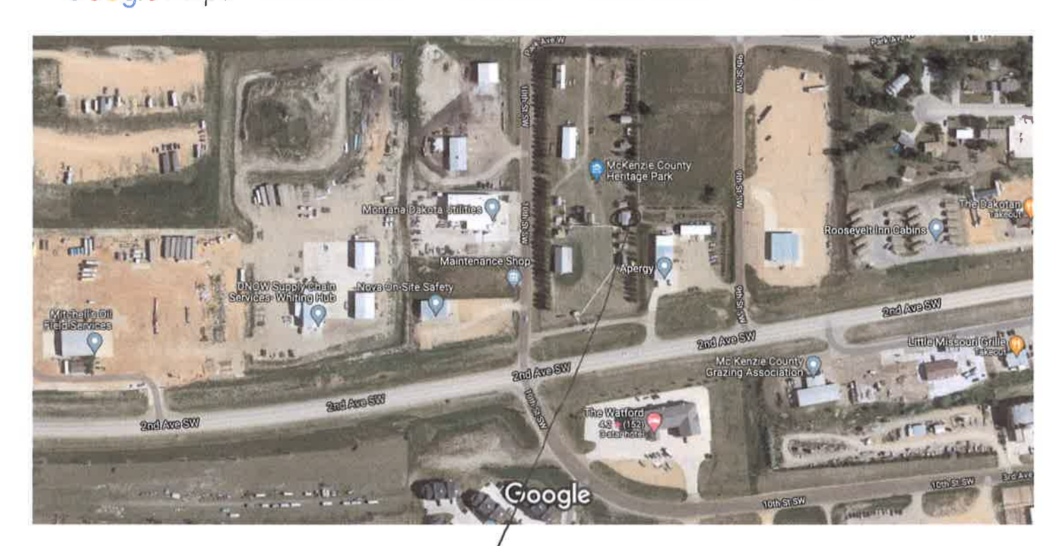
Imagery ©2021 Maxar Technologies, USDA Farm Service Agency, Map data ©2021 200 ft