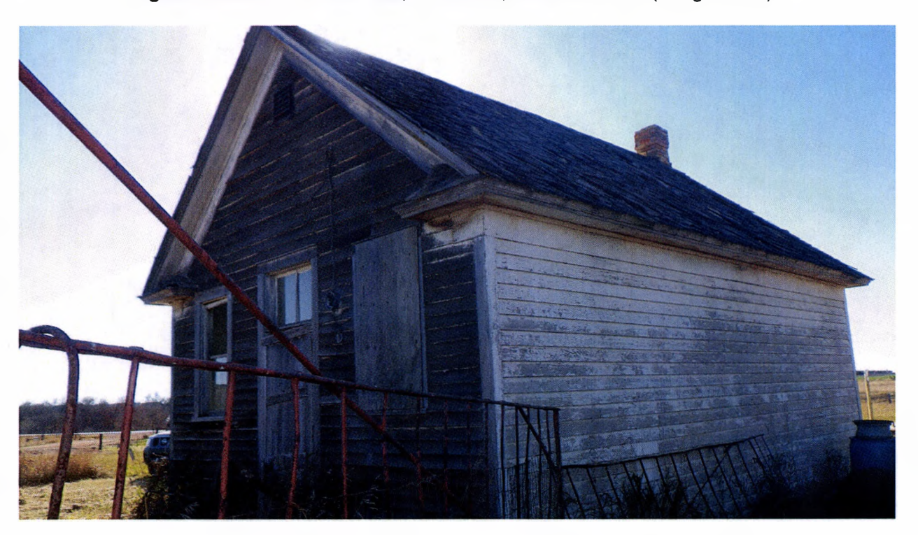
Figure 2: Site MAC-NKL-60x, Feature 1, view southwest (Image 5728).