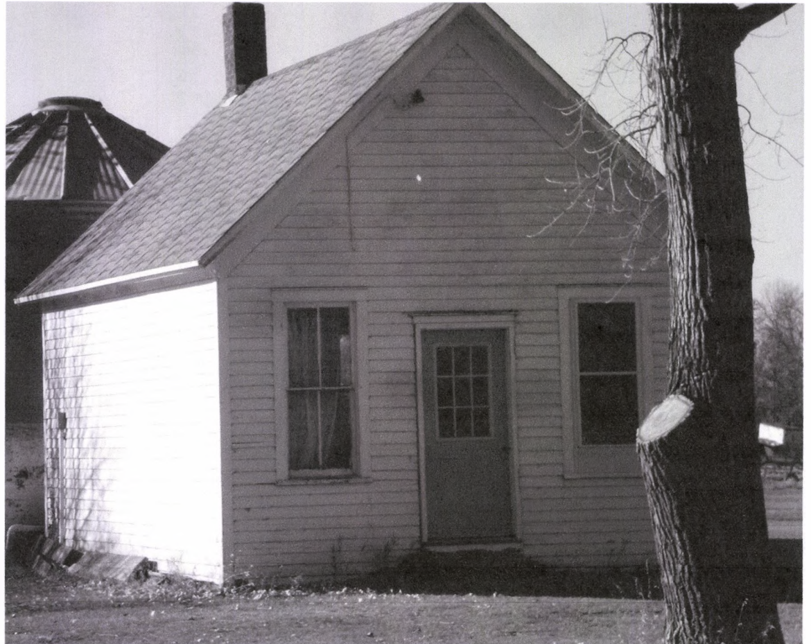
Another view of the East Side