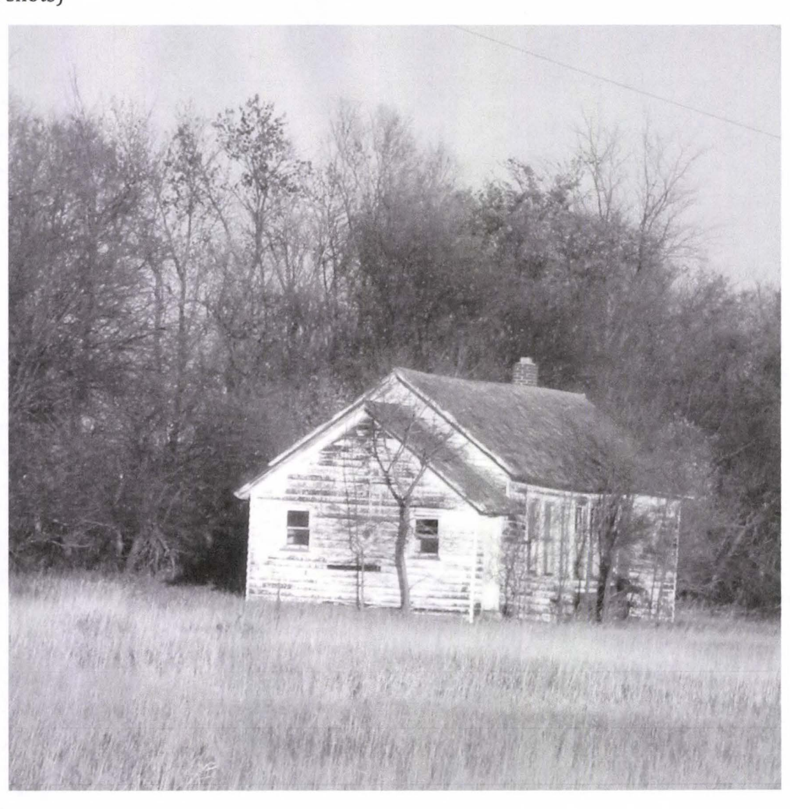
West Side (two shots)