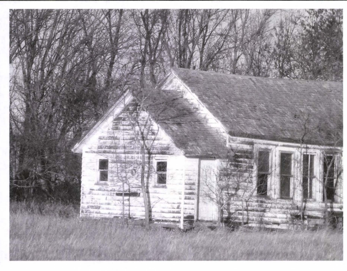
Adler Township School