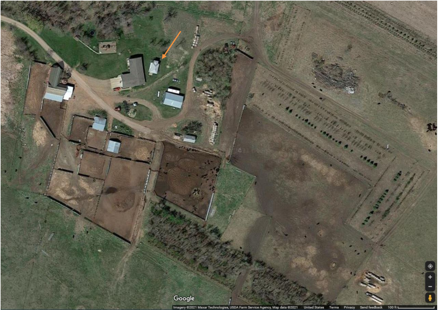
Google Earth image downloaded 6/28/2021

Recorded By: Lorna Meidinger Date Recorded: 6/28/2021