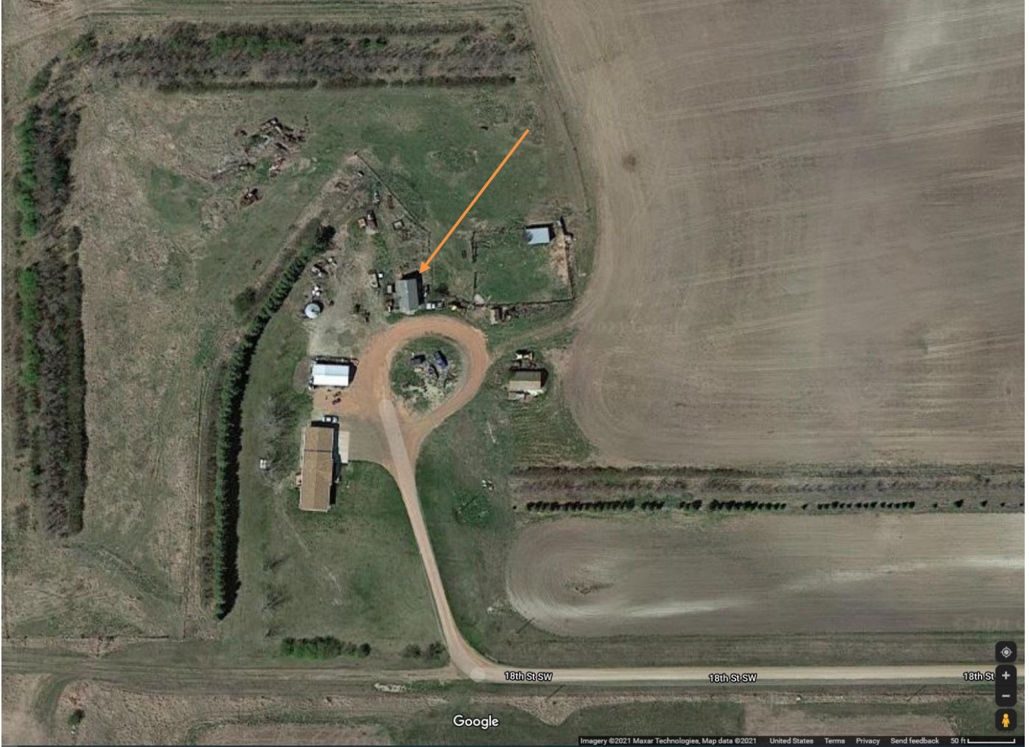
Google Earth image downloaded 6/28/2021

Recorded By: Lorna Meidinger Date Recorded: 6/28/2021