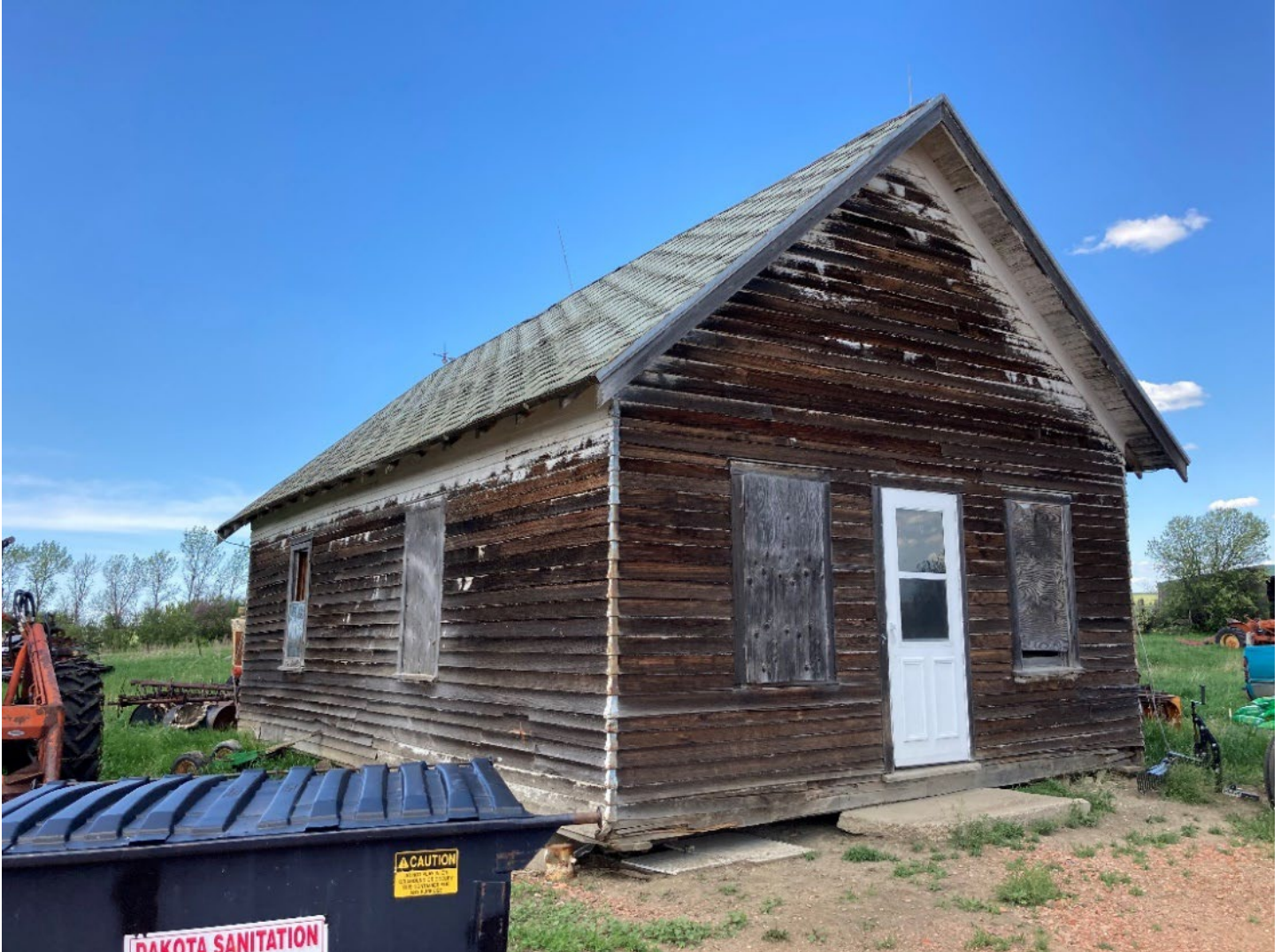
Overview of the historic schoolhouse on site, looking northeast. [Taken from report.]