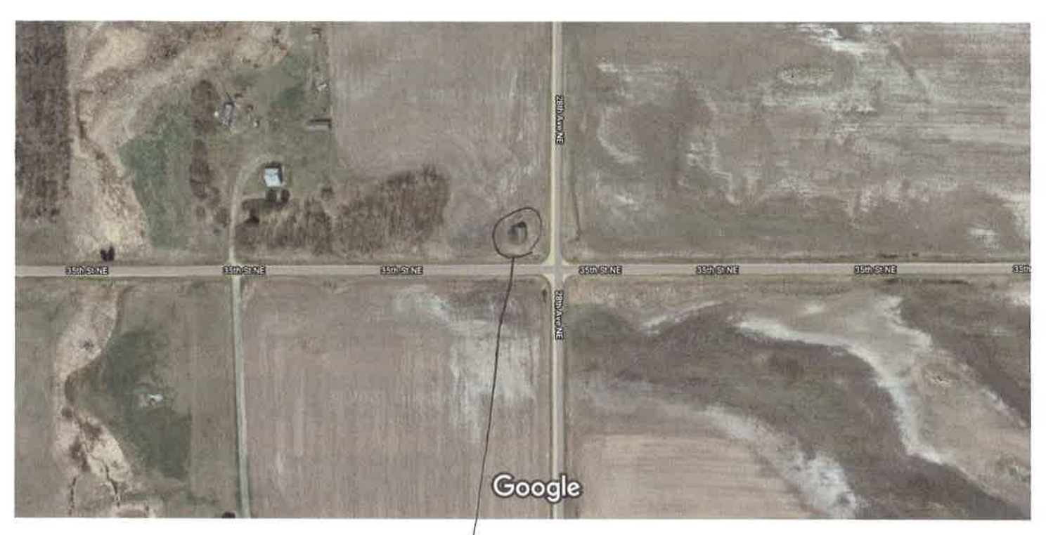
100 ft