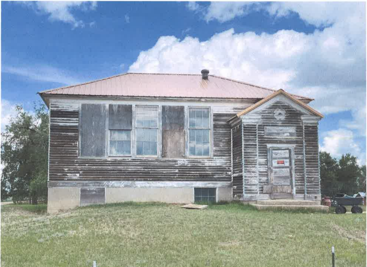
South Side – New Roof – June 2021