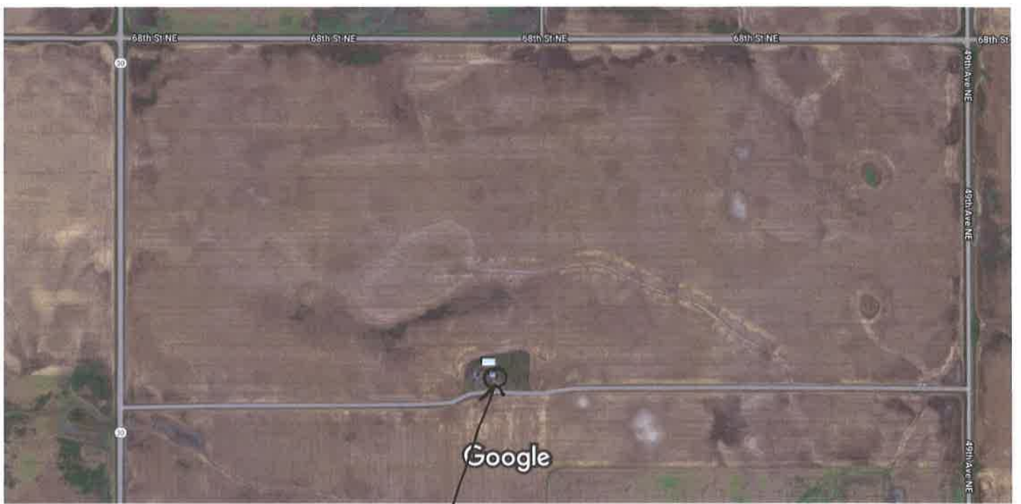
Imagery ©2022 CNES / Airbus, Maxar Technologies, USDA/FPAC/GEO, Map data 500 ft ©2022