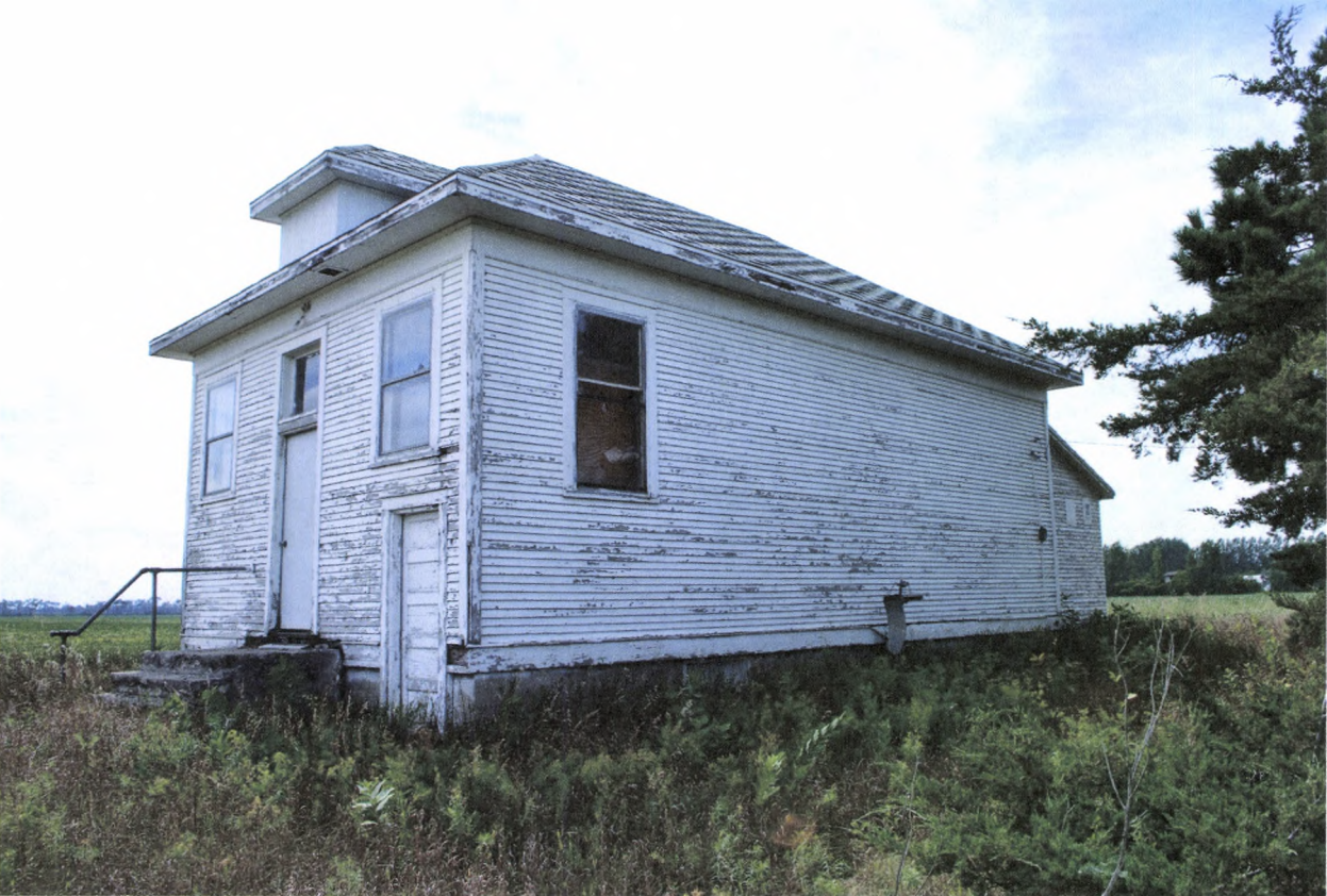
Danton School, NE