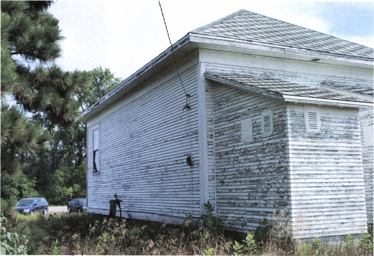
Danton School, NE