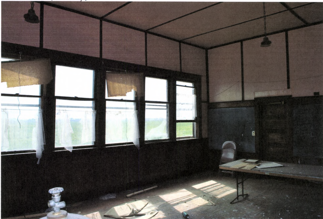
Danton School, interior SW