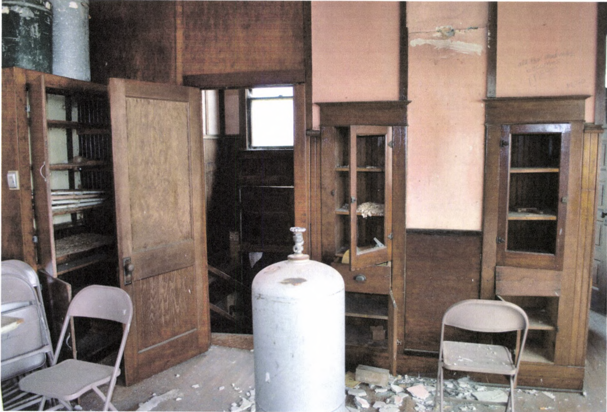
Danton School, interior east wall