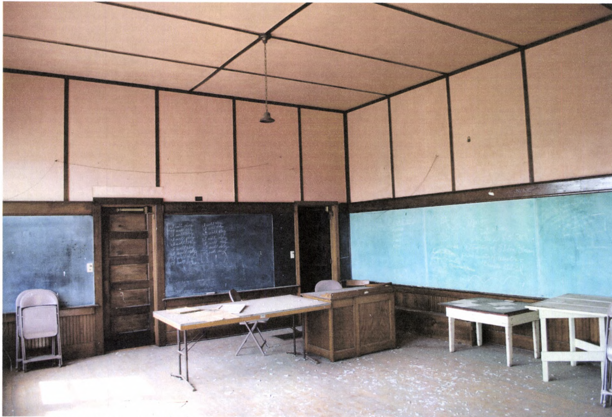
Danton School, interior NW