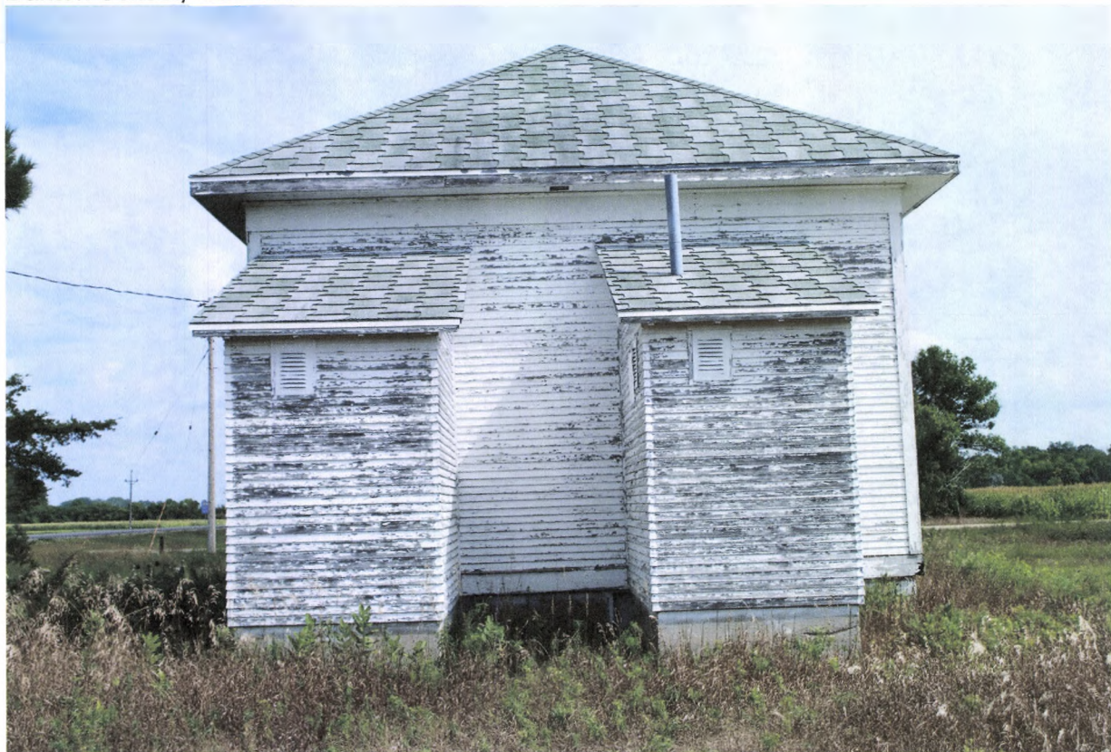
Danton School, west