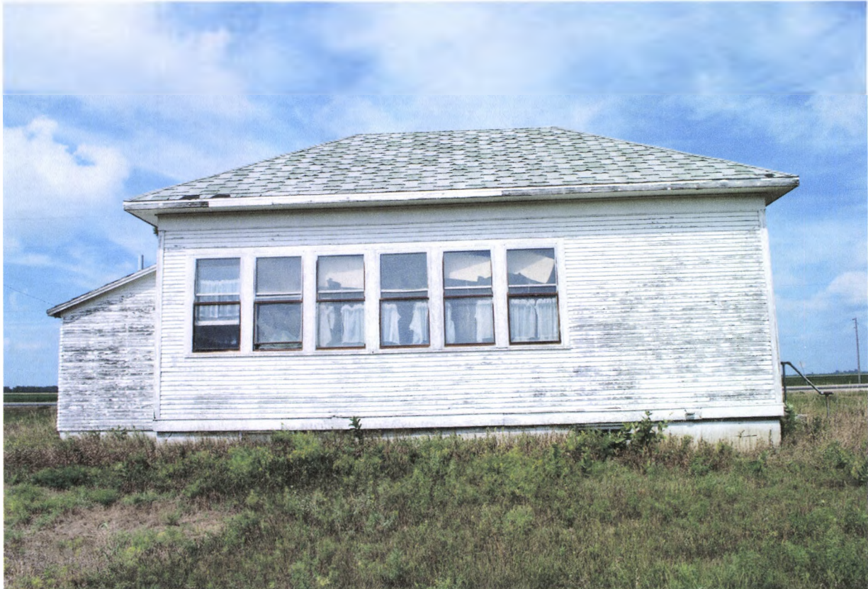
Danton School, south