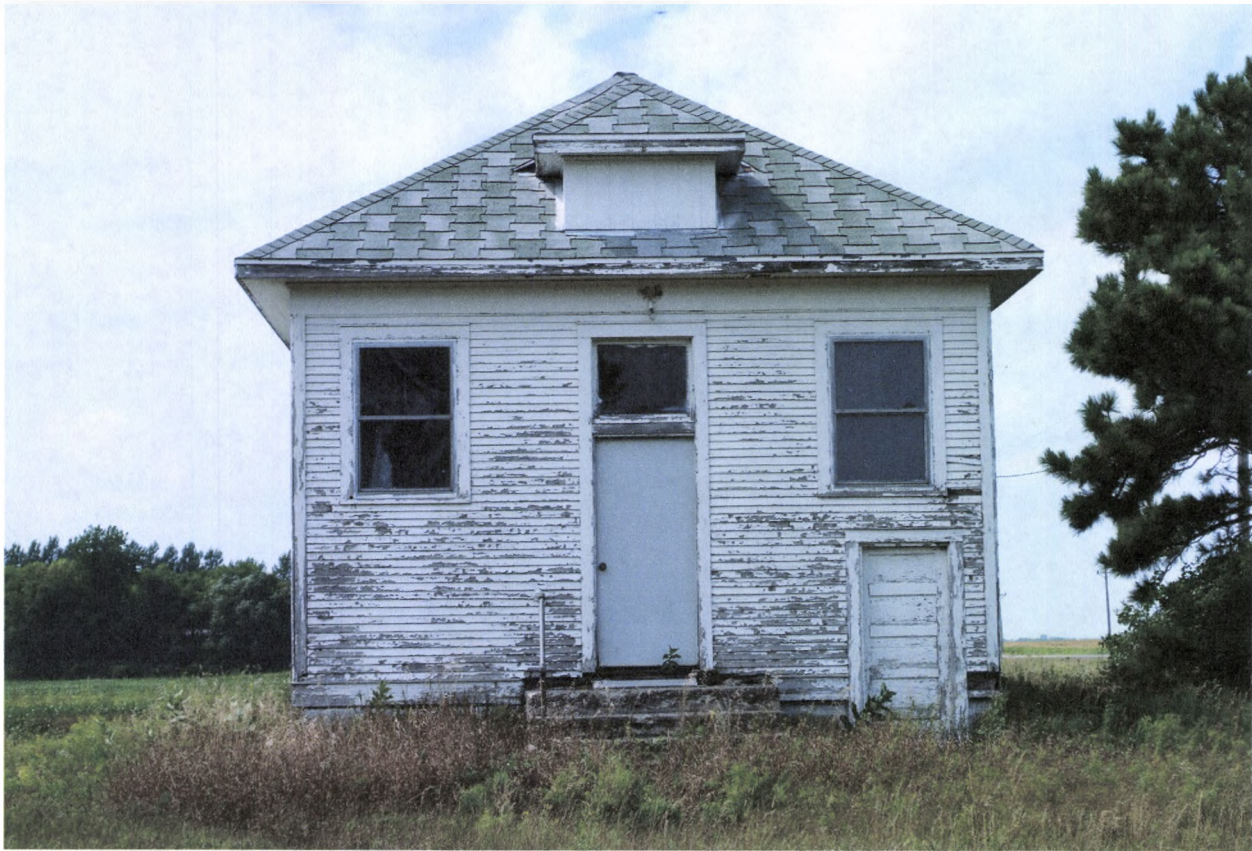
Danton School front, east