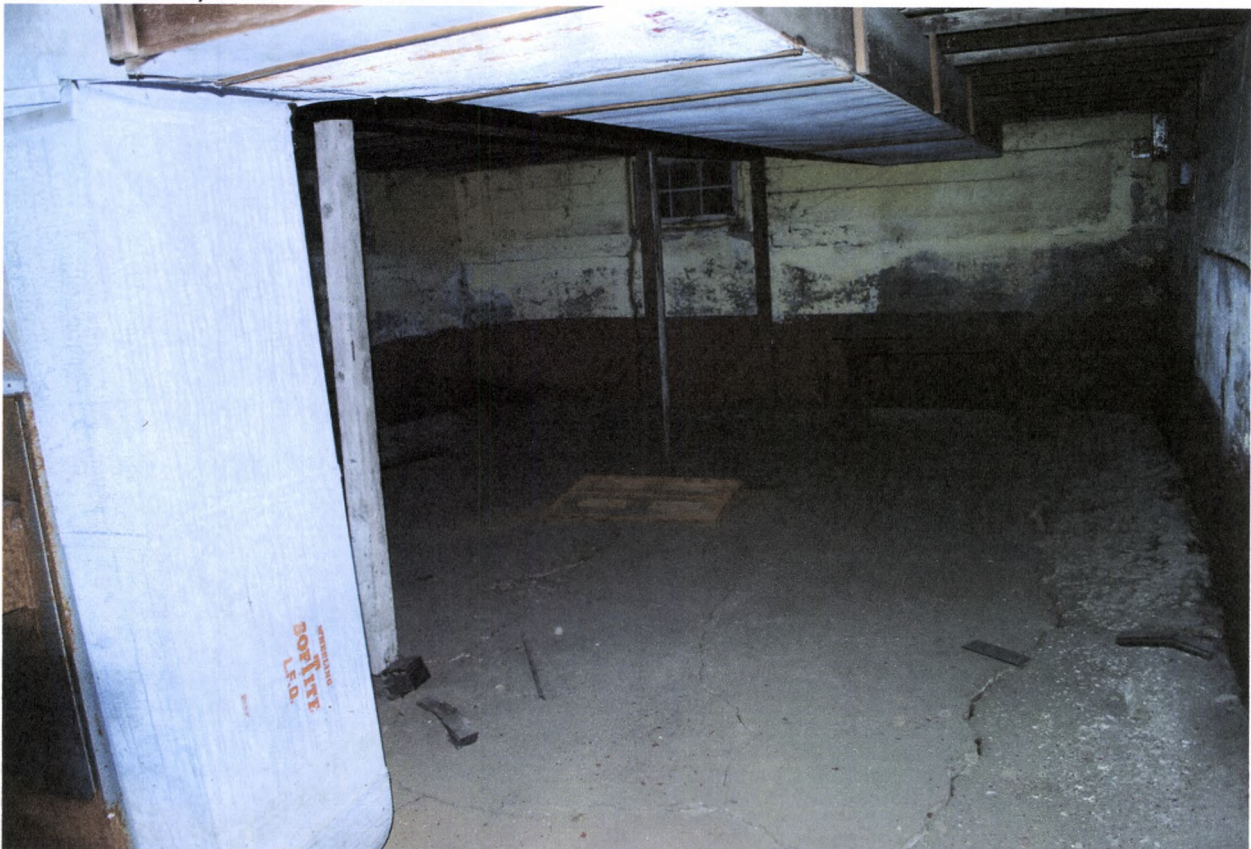
Danton School, interior basement, west wall