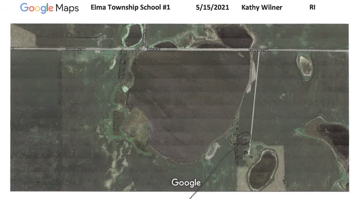
Imagery ©2021 Maxar Technologies, USDA Farm Service Agency, Map data ©2021 500 ft