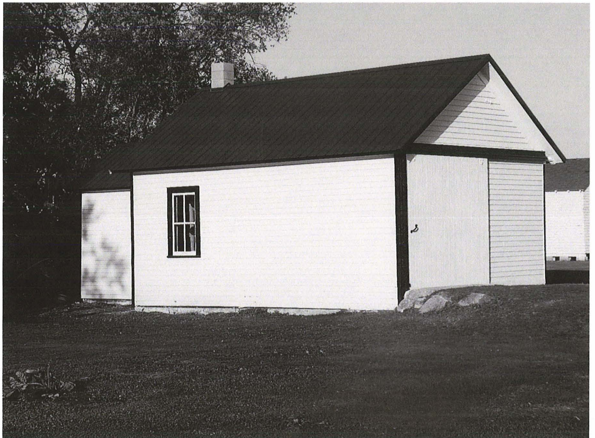
West Side & South Side