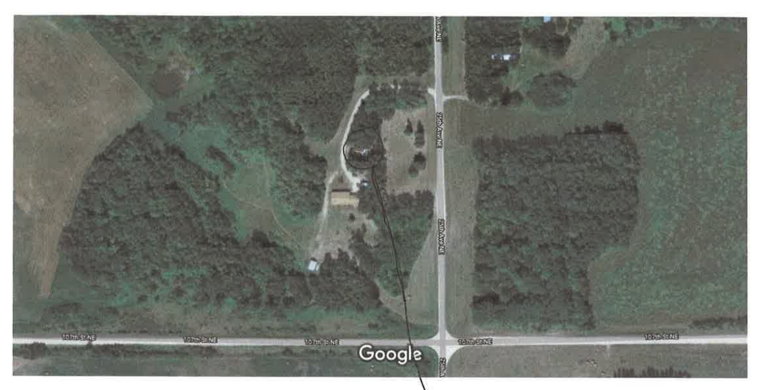
100 ft