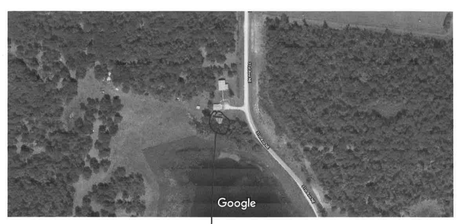
Imagery ©2021 Maxar Technologies, USDA Farm Service Agency, Map data ©2021 100 ft