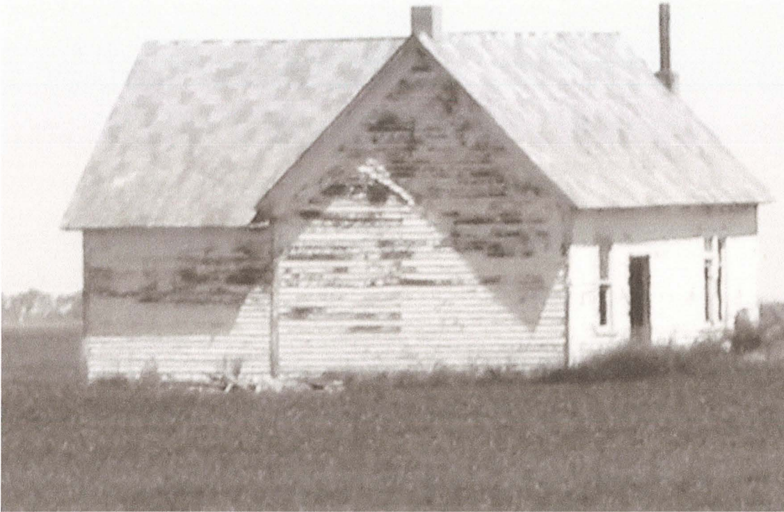
White Ash Township School