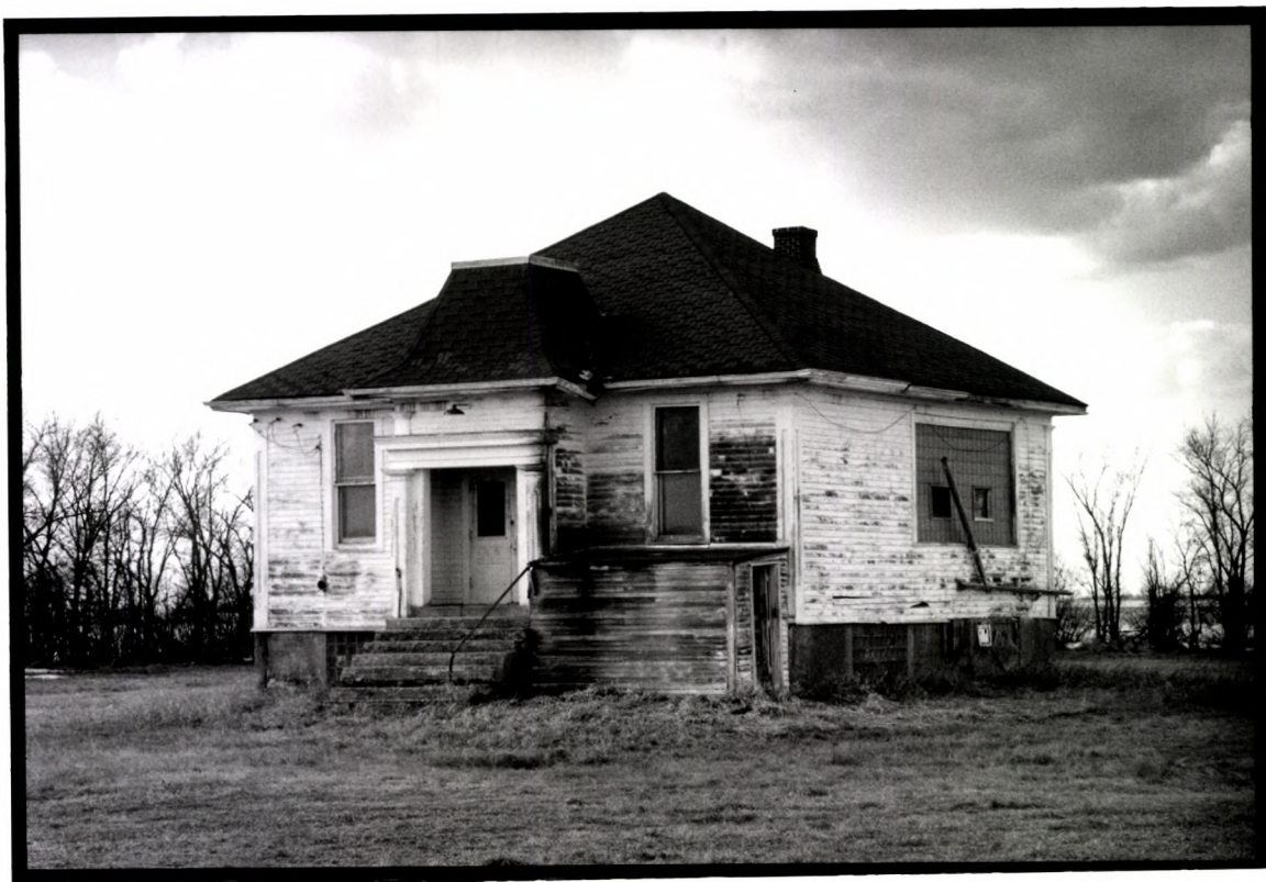
SOUTH FRONT & EAST ELEVATIONS.

Include direction facing, feature number, and photo caption for each submitted photograph.