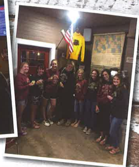
The Schoolhouse, formally Herman #1, was moved to DeLaMere and is approximately 20 feet by 30 feet. The Munds added restrooms, a small kitchen and a walk-in cooler.