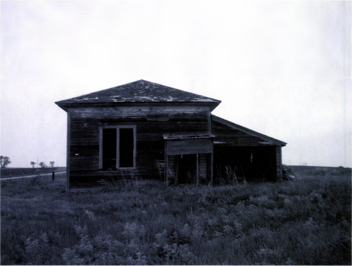
Edgemont Twsp. School South Side 05/22/2012 Kathy Wilner SH