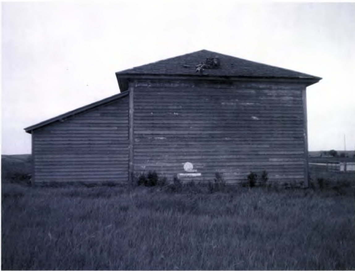
Edgemont Twsp. School North Side 05/22/2012 Kathy Wilner SH