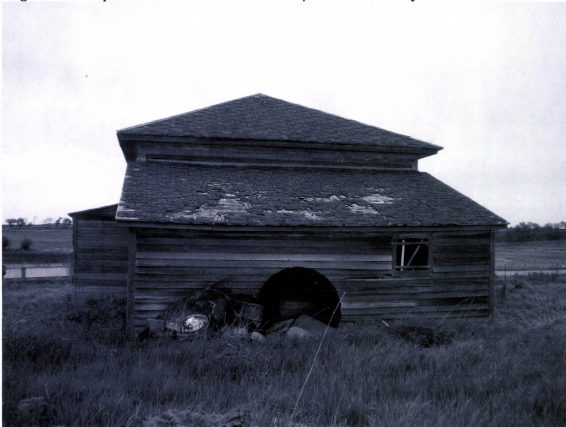
Edgemont Twsp. School East Side 05/2022012 Kathy Wilner SH