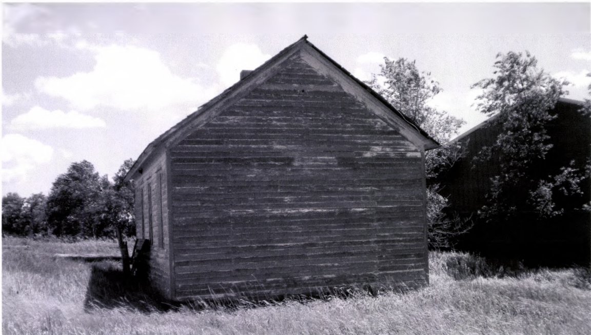
Lamont Twsp. School West Side 06/08/2012 Kathy Wilner SH