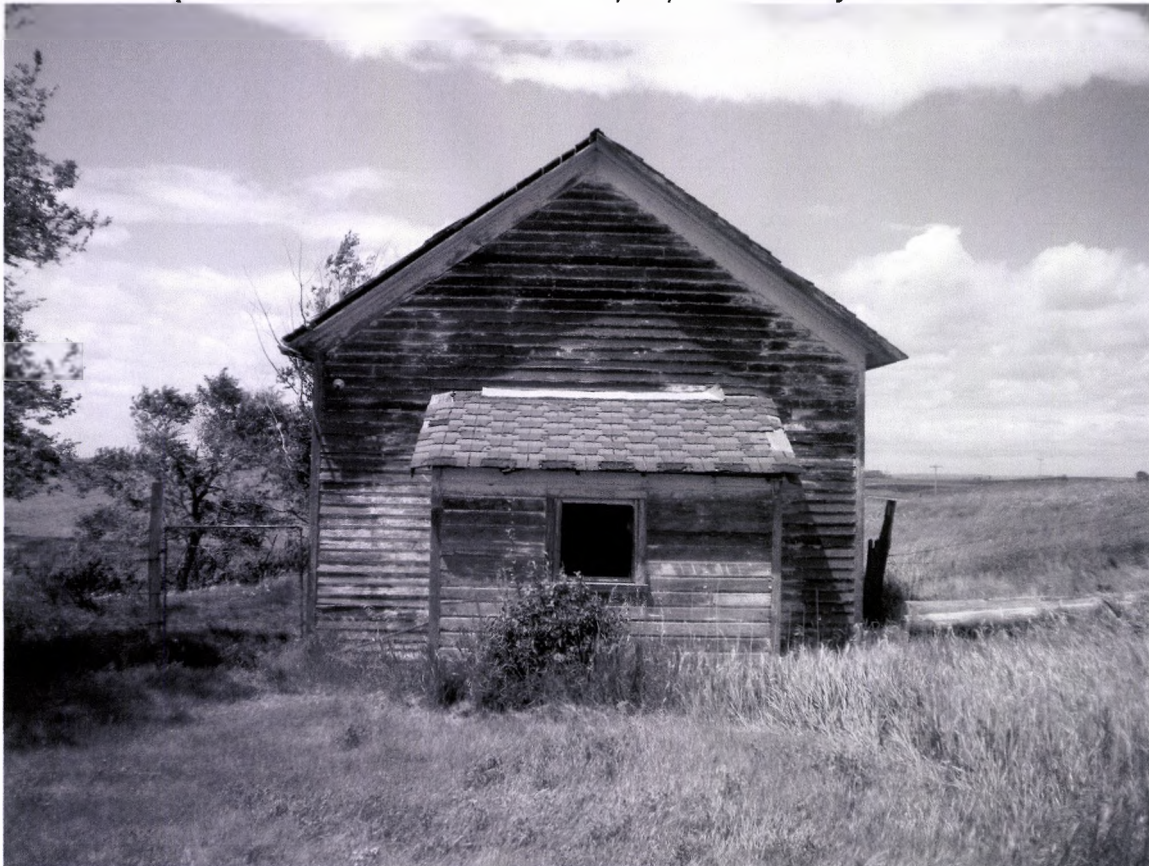
Lamont Twsp. School East Side 06/10/2012 Kathy Wilner SH