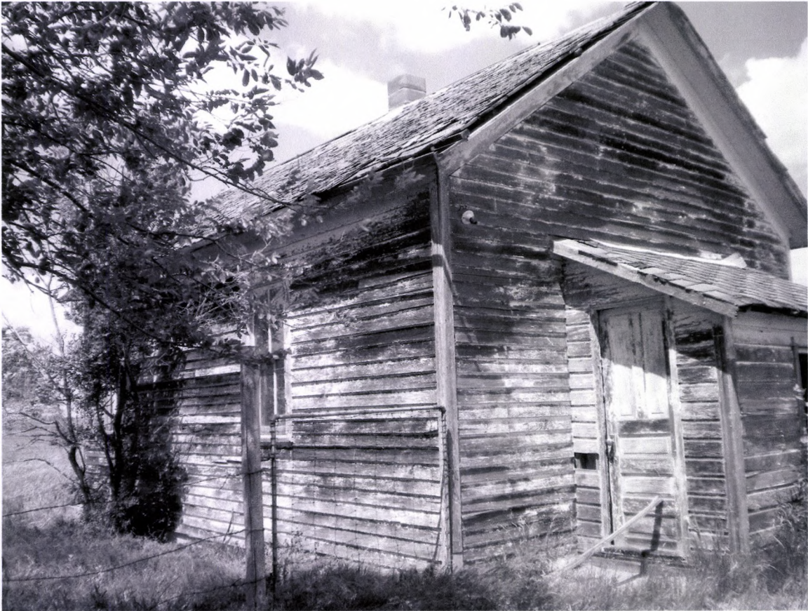
Lamont Twsp. School South Side 06/08/2012 Kathy Wilner SH