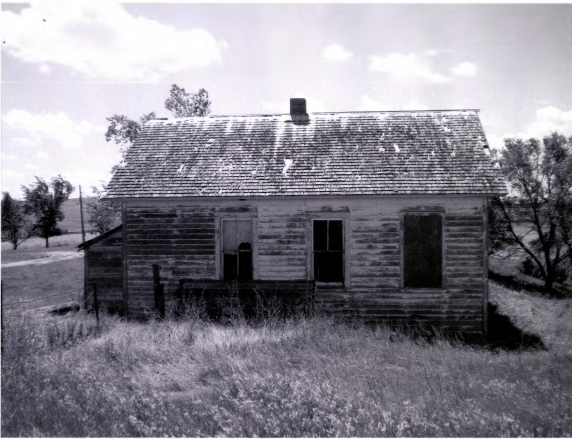
Lamont Twsp. School North Side 06/10/2012 Kathy Wilner SH