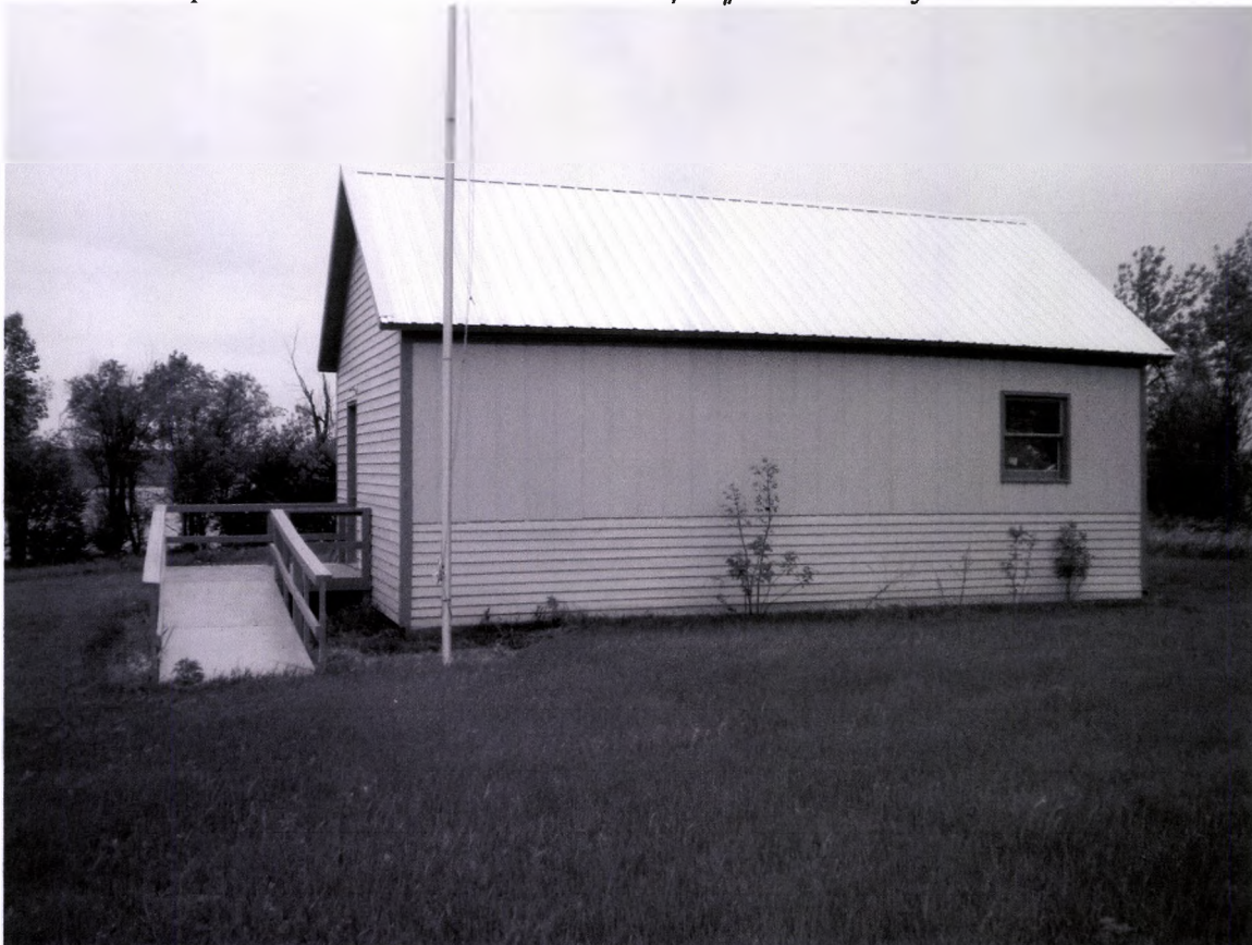
Pickard Twsp. School North Side 05/20/2012 Kathy Wilner SH