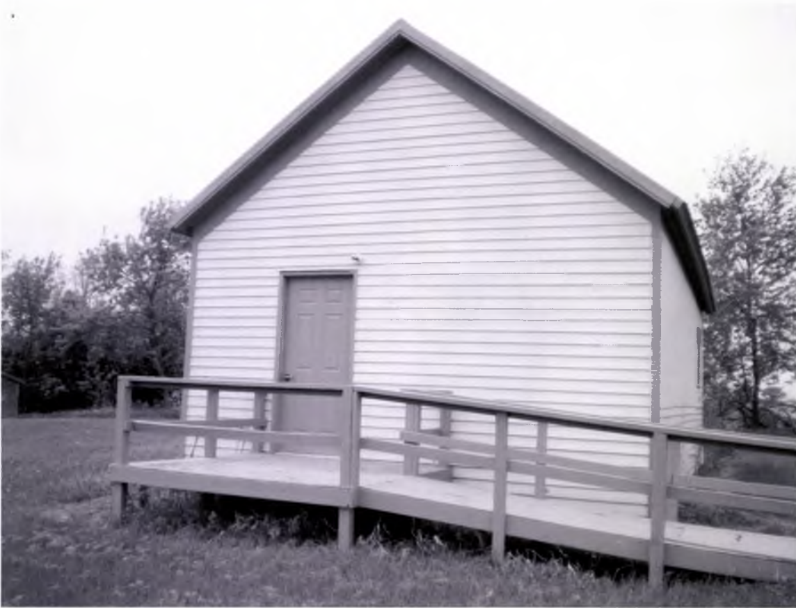
Pickard Twsp. School East Side 05/20/2012 Kathy Wilner SH