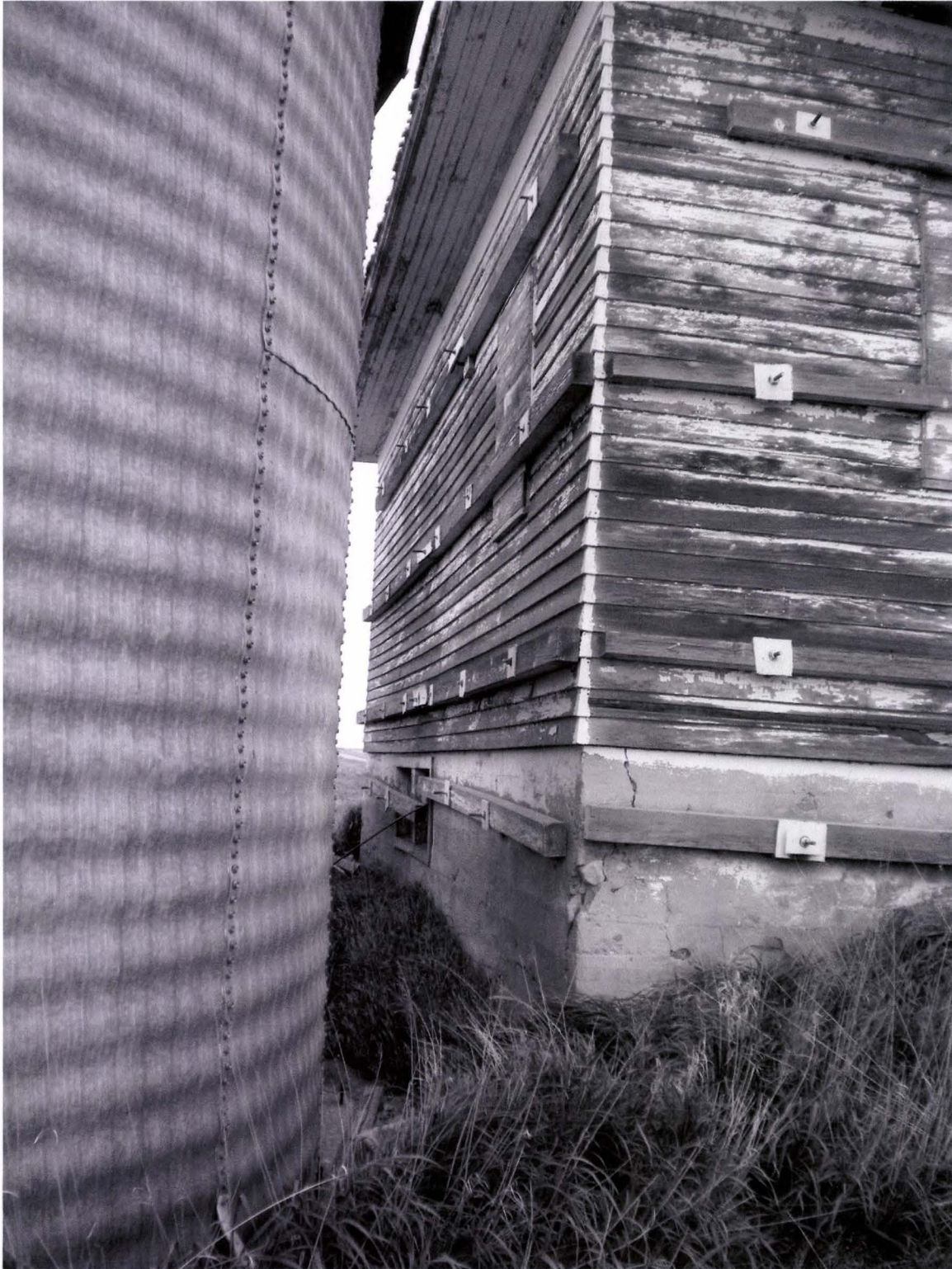
Boone Twsp. School #1 West Side 05/20/2012 Kathy Wilner SH