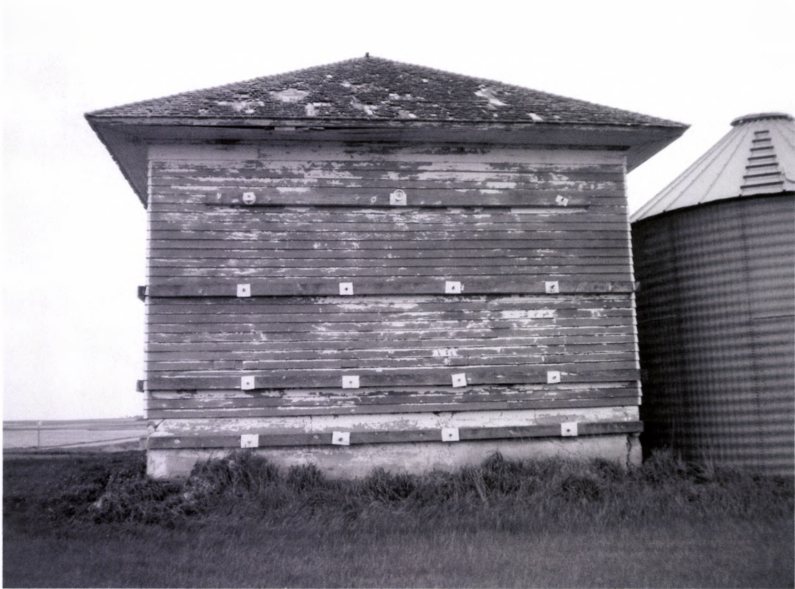
Boone Twsp. School #1 North Side 05/29/2012 Kathy Wilner SH