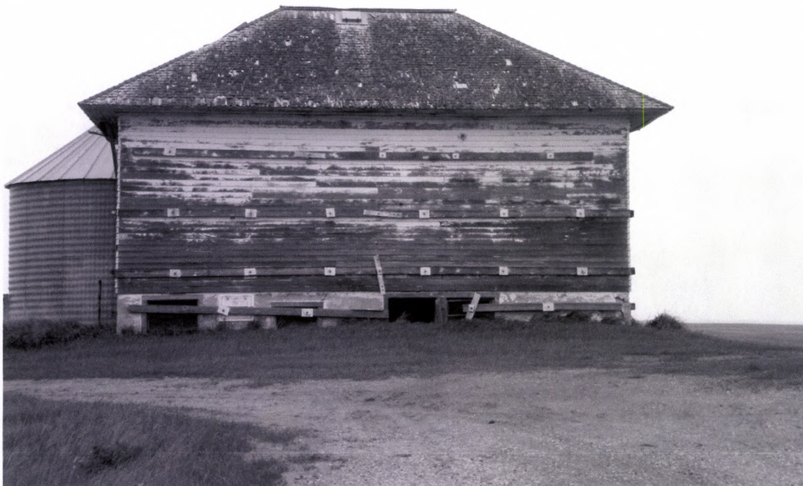
Boone Twsp. School #1 East Side 05/20/2012 Kathy Wilner SH