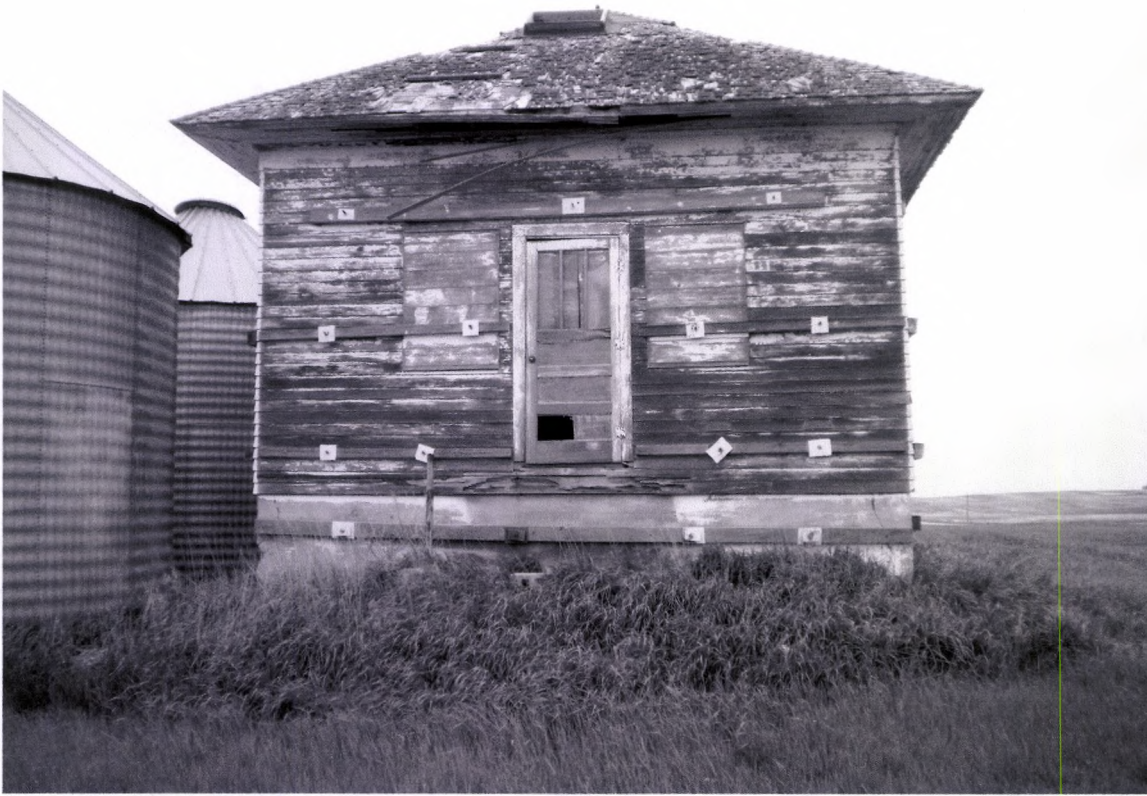
Boone Twsp. School #1 South Side 05/20/2012 Kathy Wilner SH