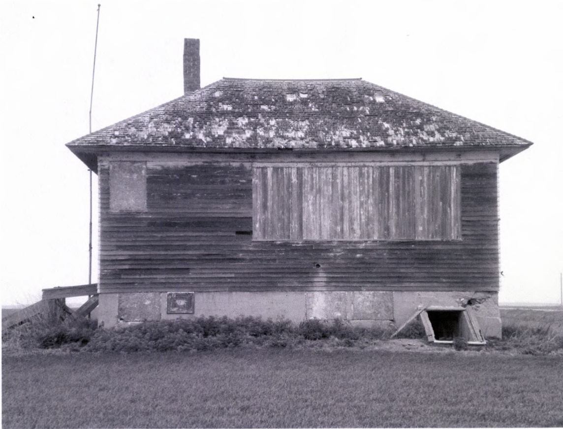
Boone Twsp. School #4 East Side 05/22/2012 Kathy Wilner SH