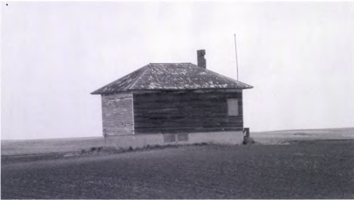
Boone Twsp. School #4 West Side 05/22/2012 Kathy Wilner SH