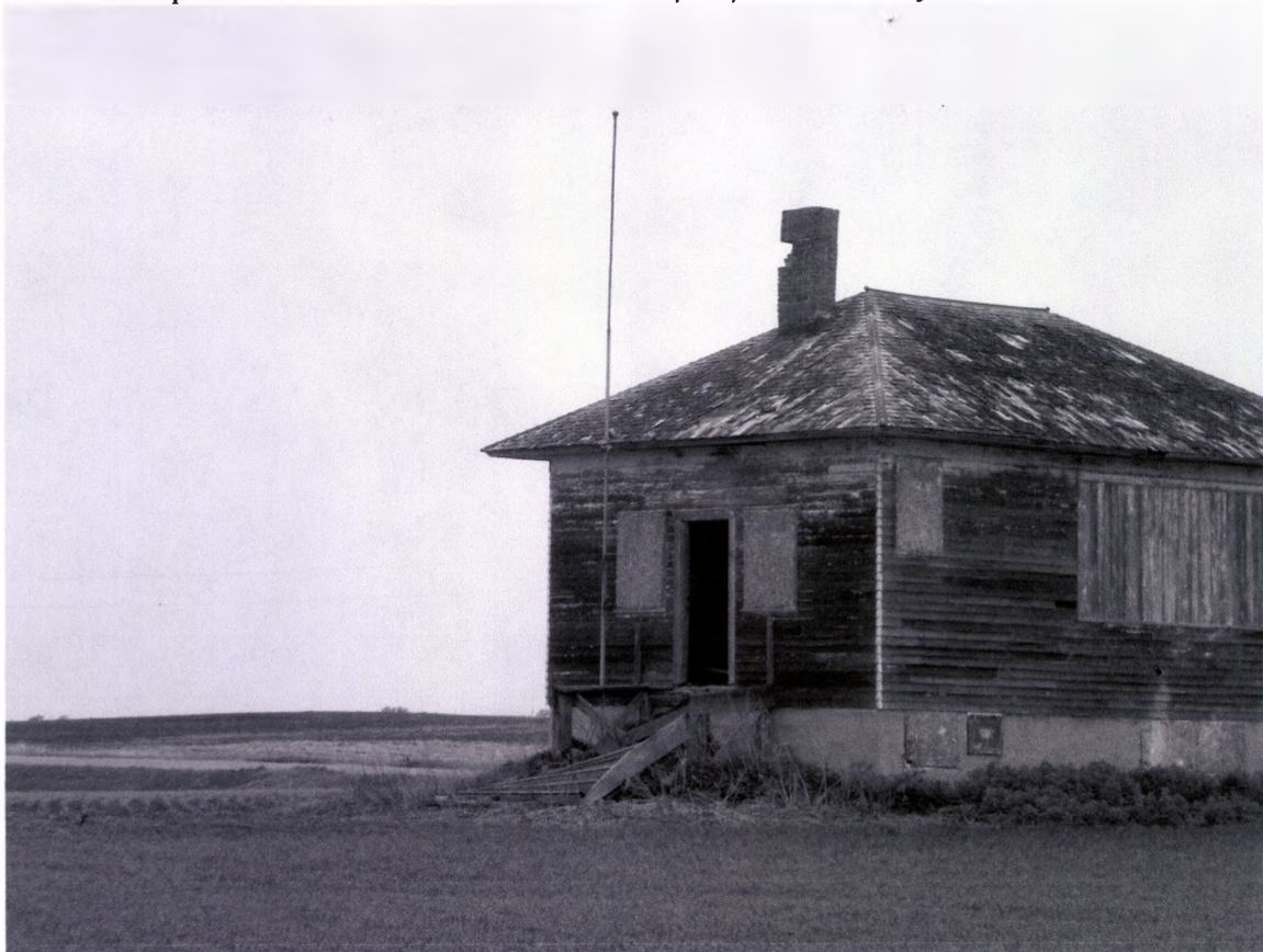
Boone Twsp. School #4 South Side 05/22/2012 Kathy Wilner SH