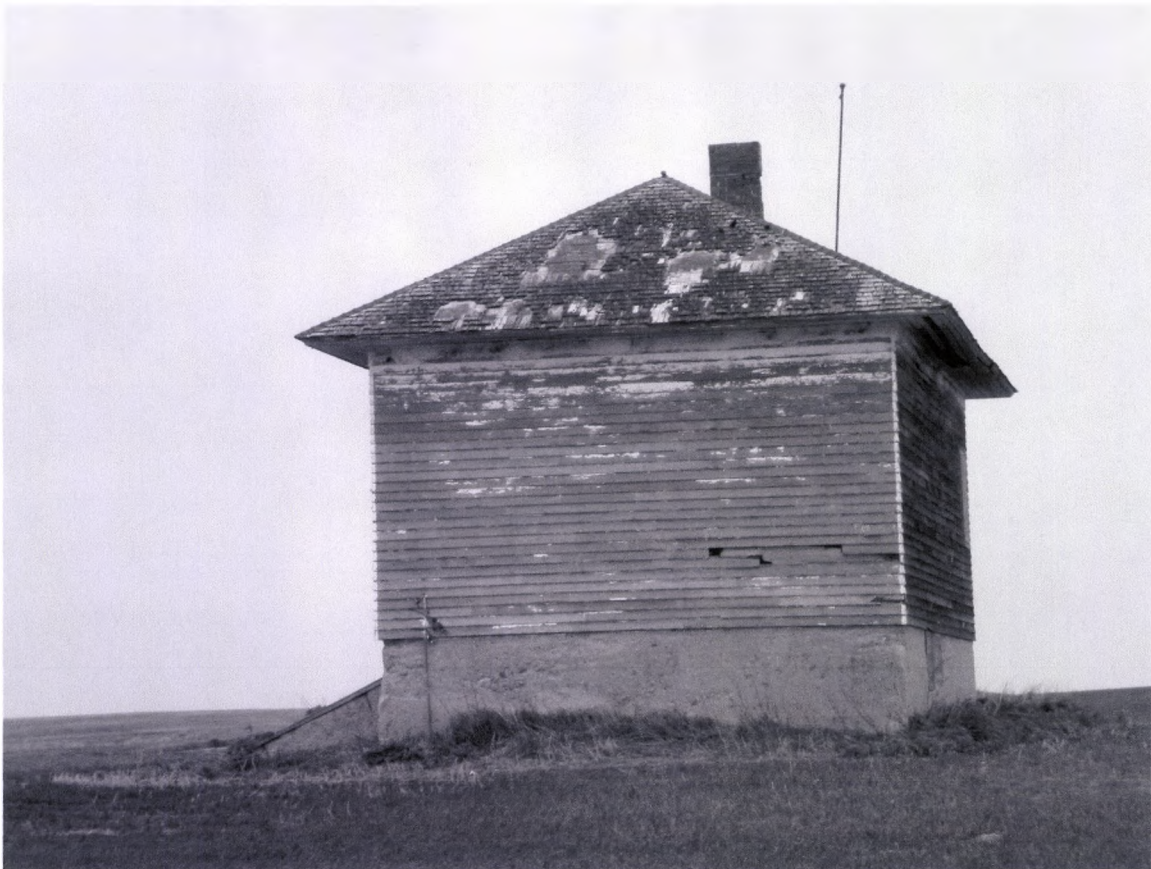
Boone Twsp. School #4 North Side 05/22/2012 Kathy Wilner SH