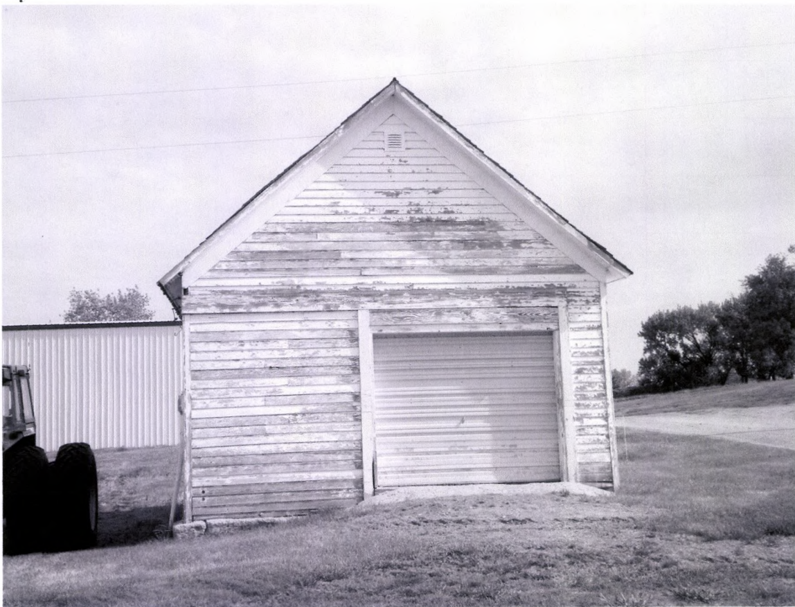
Lincoln Dale School #4 South Side 05/20/2012 Kathy Wilner SH