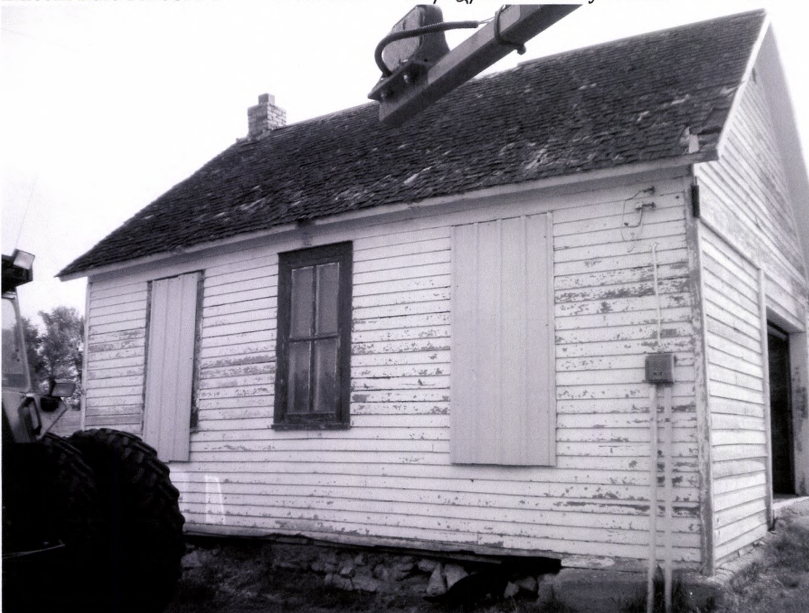
Lincoln Dale School #4 West Side 05/20/2012 Kathy Wilner SH