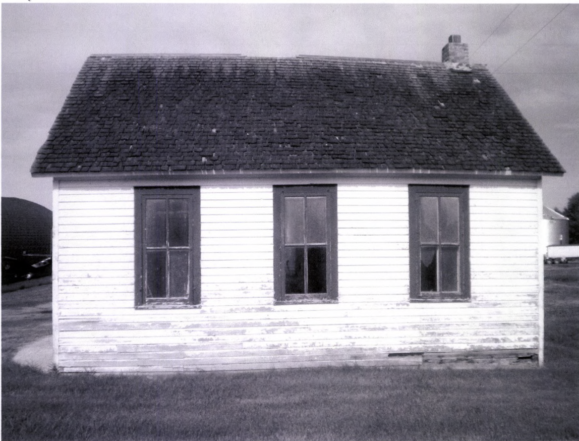
Lincoln Dale School #4 East Side 05/29/2012 Kathy Wilner SH