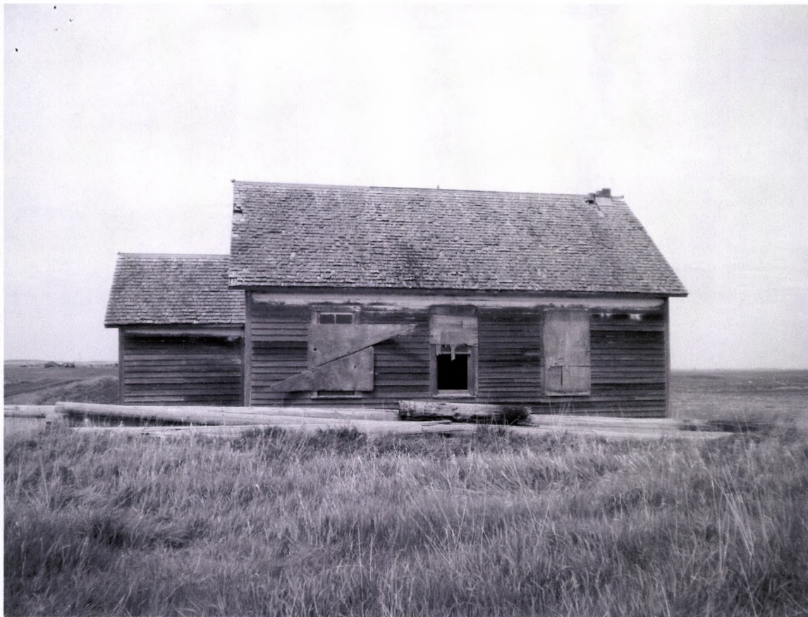
Granville School #2 East Side 05/20/2012 Kathy Wilner SH