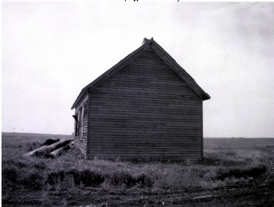
Granville School #2 North Side 05/20/2012 Kathy Wilner SH