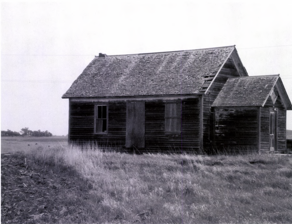
Granville School #2 West Side 05/29/2012 Kathy Wilner SH