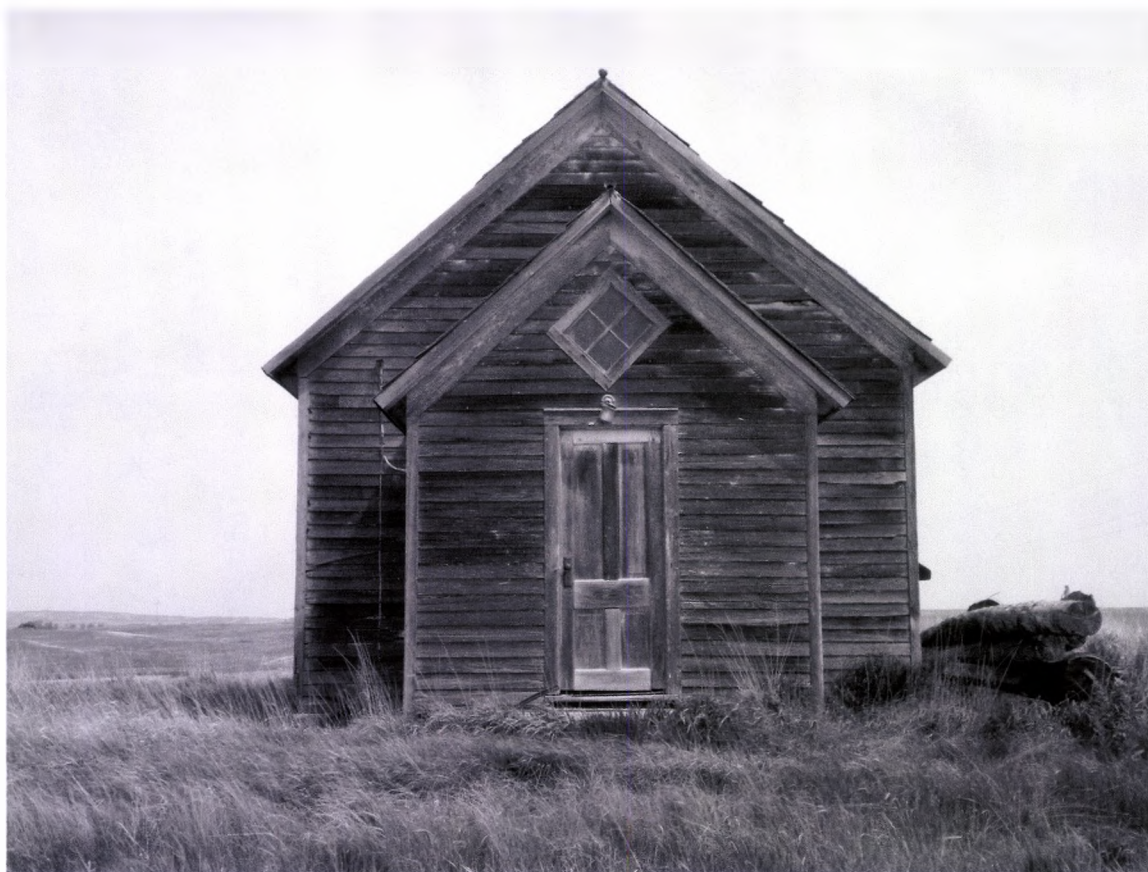
Granville School #2 South Side 05/29/2012 Kathy Wilner SH