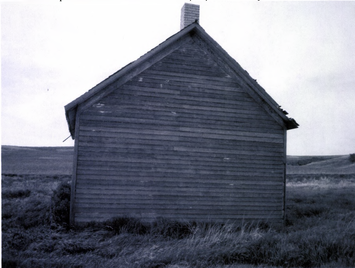
Granville Twsp. School #3 North Side 05/20/2012 Kathy Wilner SH