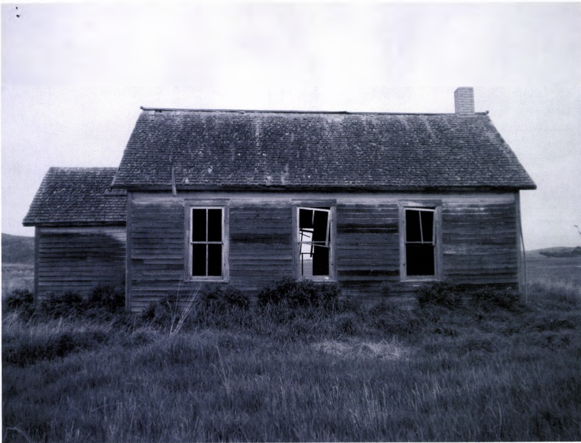
Granville Twsp. School #3 East Side 05/22/2012 Kathy Wilner SH