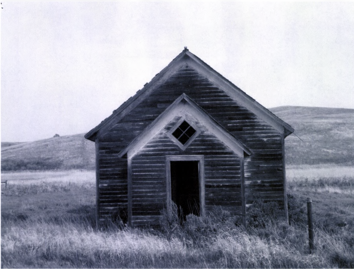
Granville Twsp. School #3 South Side 05/22/2012 Kathy Wilner SH