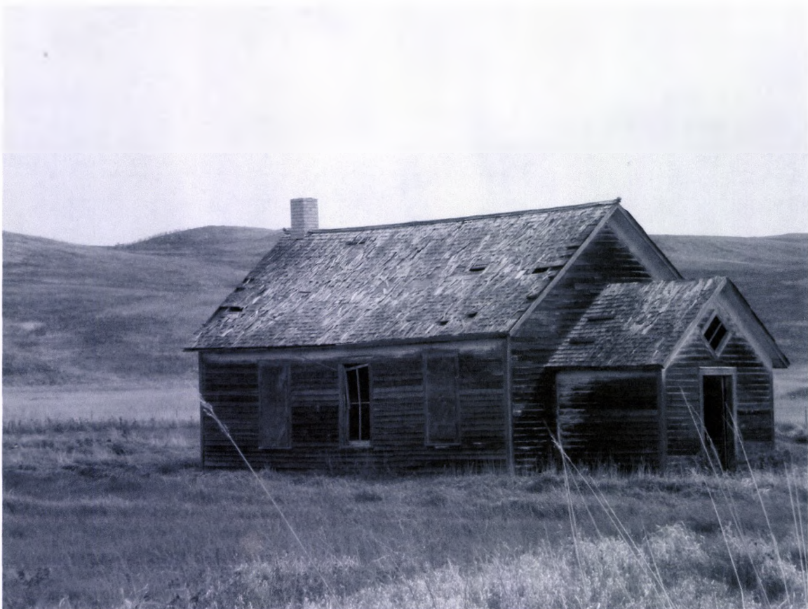
Granville Twsp. School #3 West Side 05/22/2012 Kathy Wilner SH