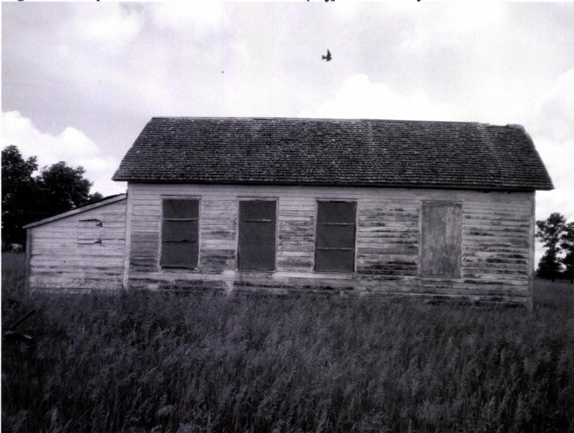
Highland Twsp. School South Side 05/20/2012 Kathy Wilner SH