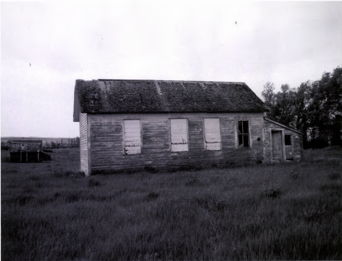
Highland Twsp. School North Side 05/20/2012 Kathy Wilner SH