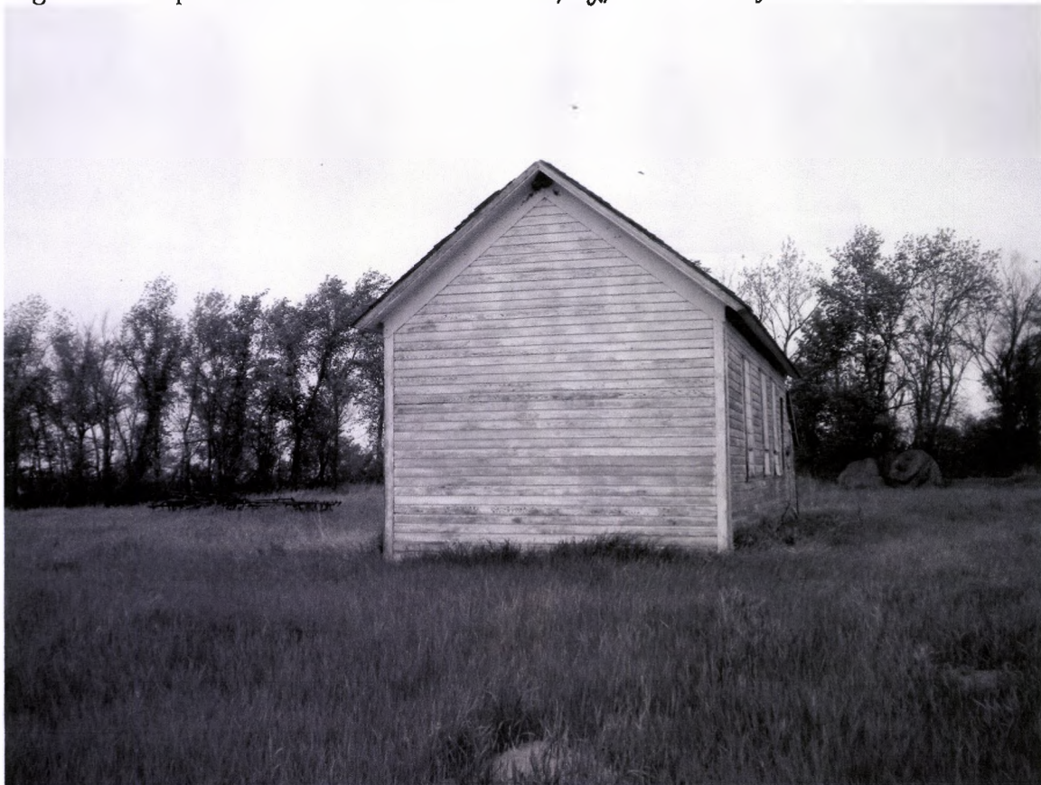
Highland Twsp. School East Side 05/20/2012 Kathy Wilner SH