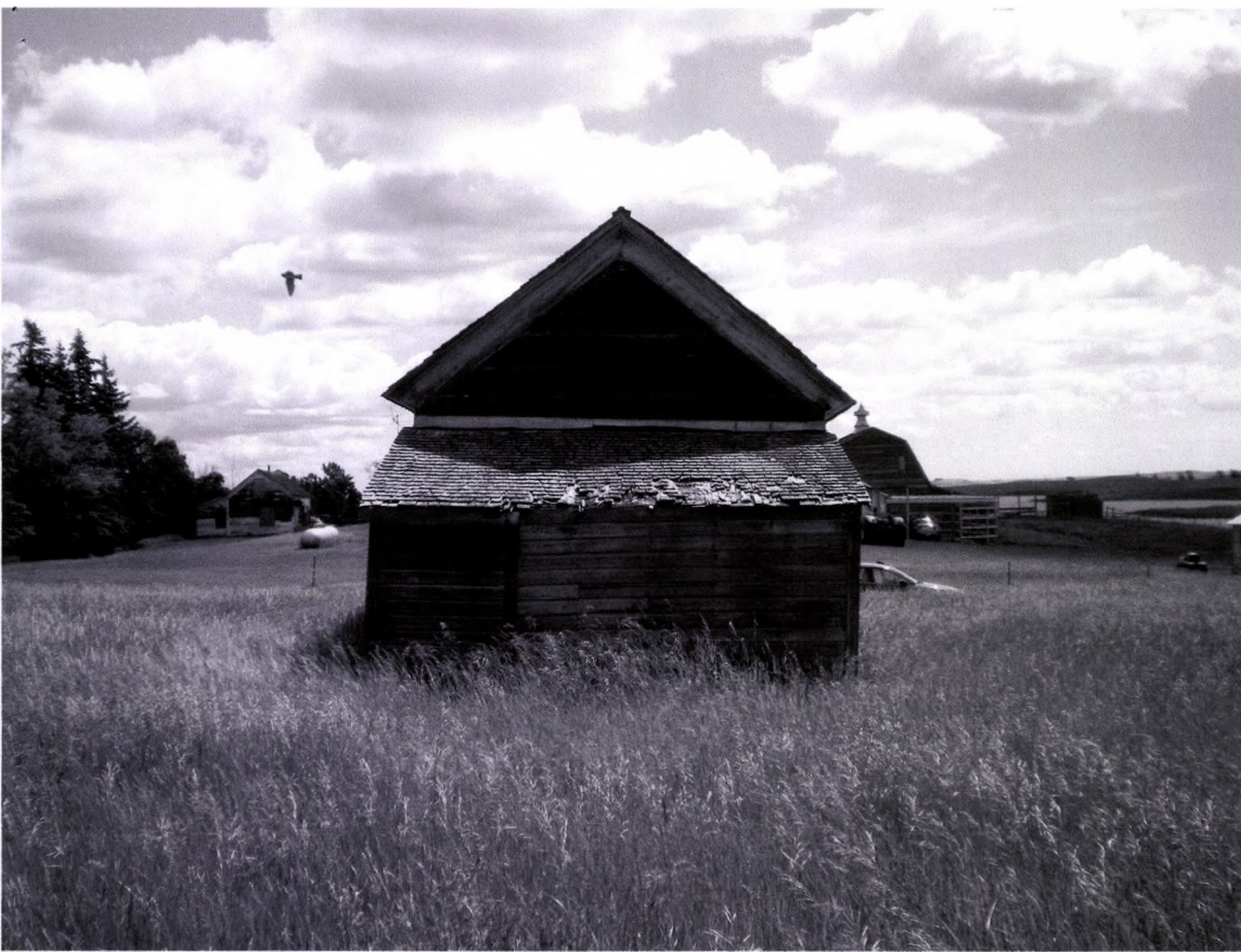
Highland Twsp. School West Side 05/20/2012 Kathy Wilner SH