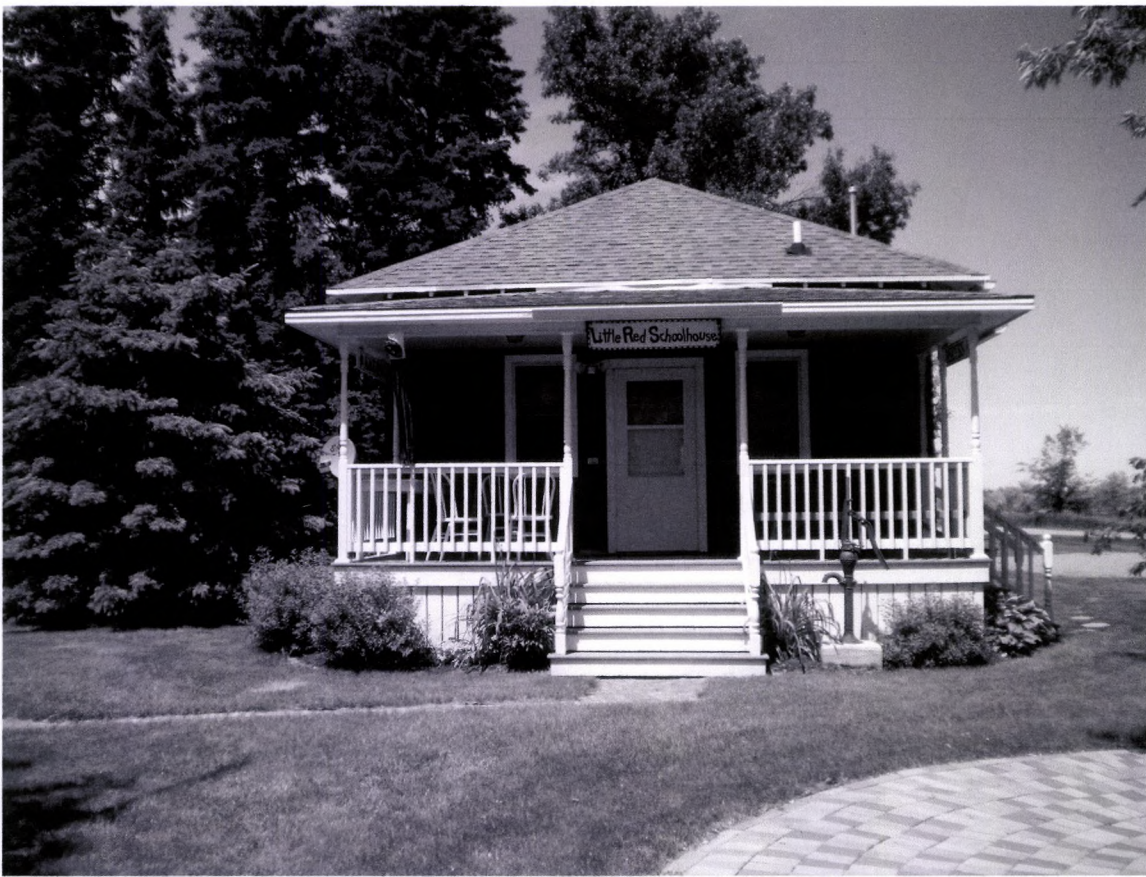
Berlin Twsp. School