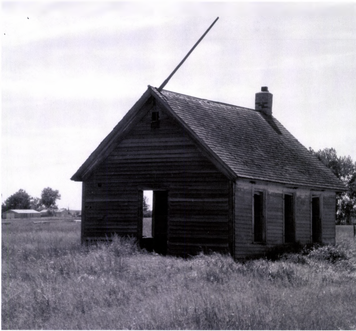
Georgetown Twsp. School East Side 06/08/2012 Kathy Wilner SH