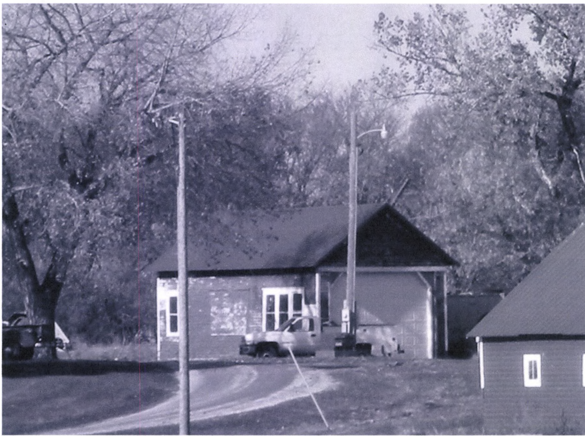
South and East Sides Mertz Township School #1 West Side