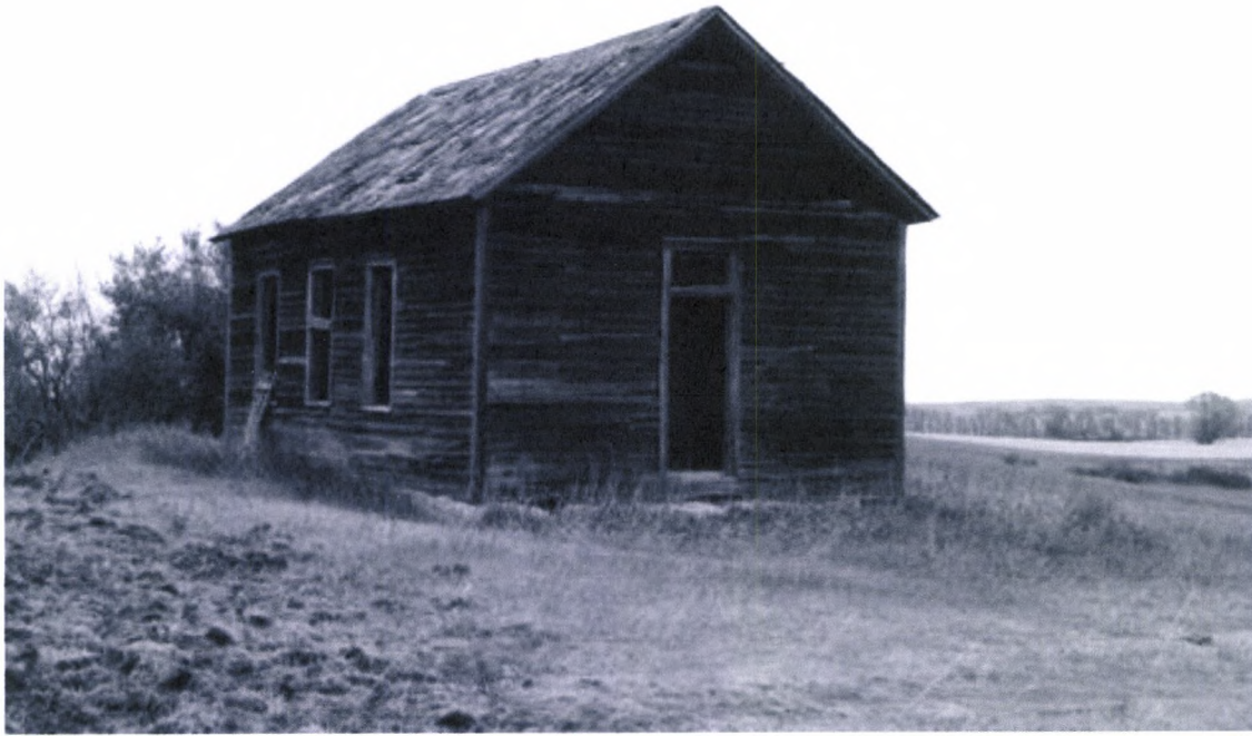
South Side Hellman Township School 10/7/2012 Tracy Stein/Kathy Wilner SH West Side