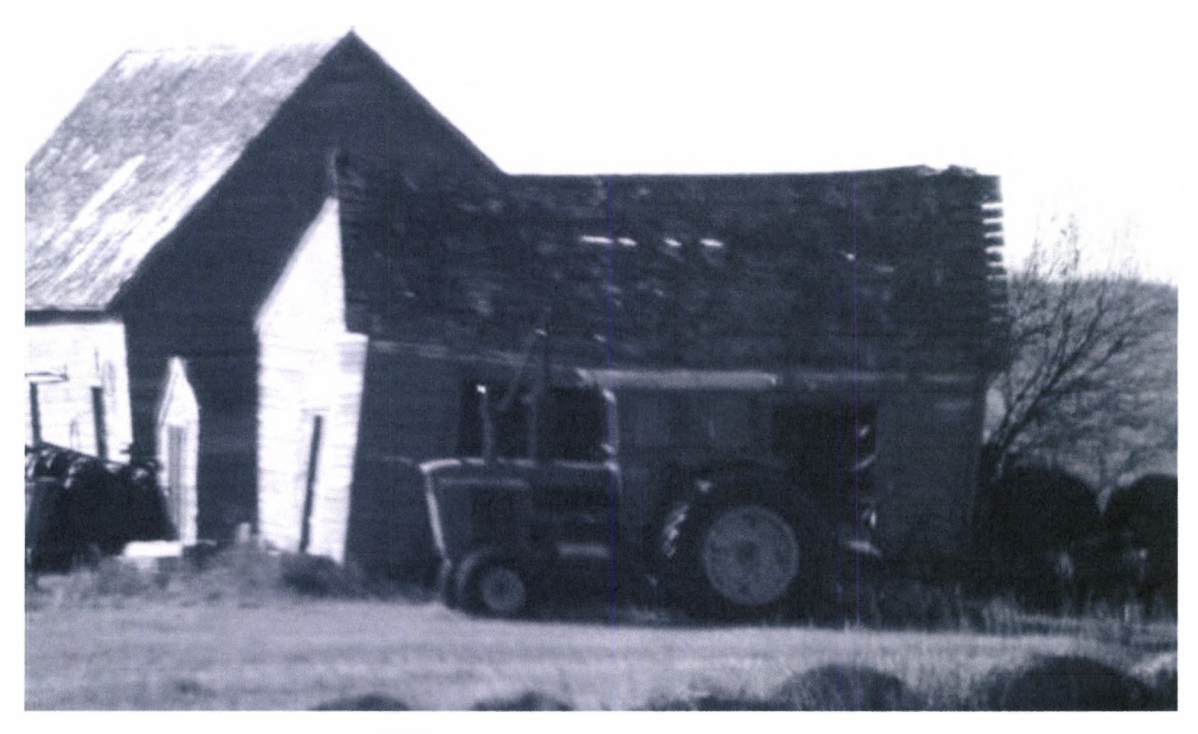
East and North Sides