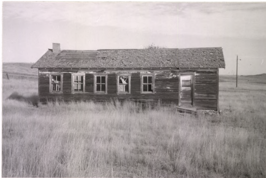
View to north over school house (roll #95-179, exposure #24).