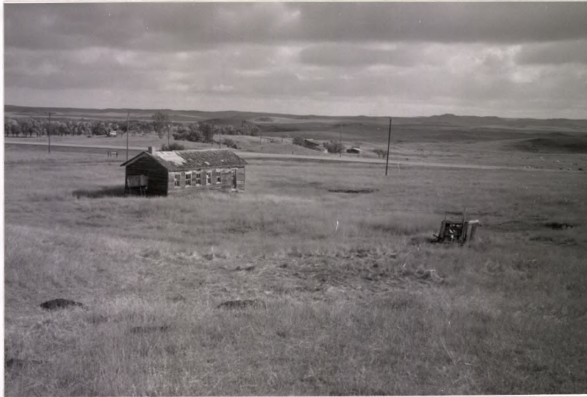
View to northeast over site (roll #95-179, exposure #6).