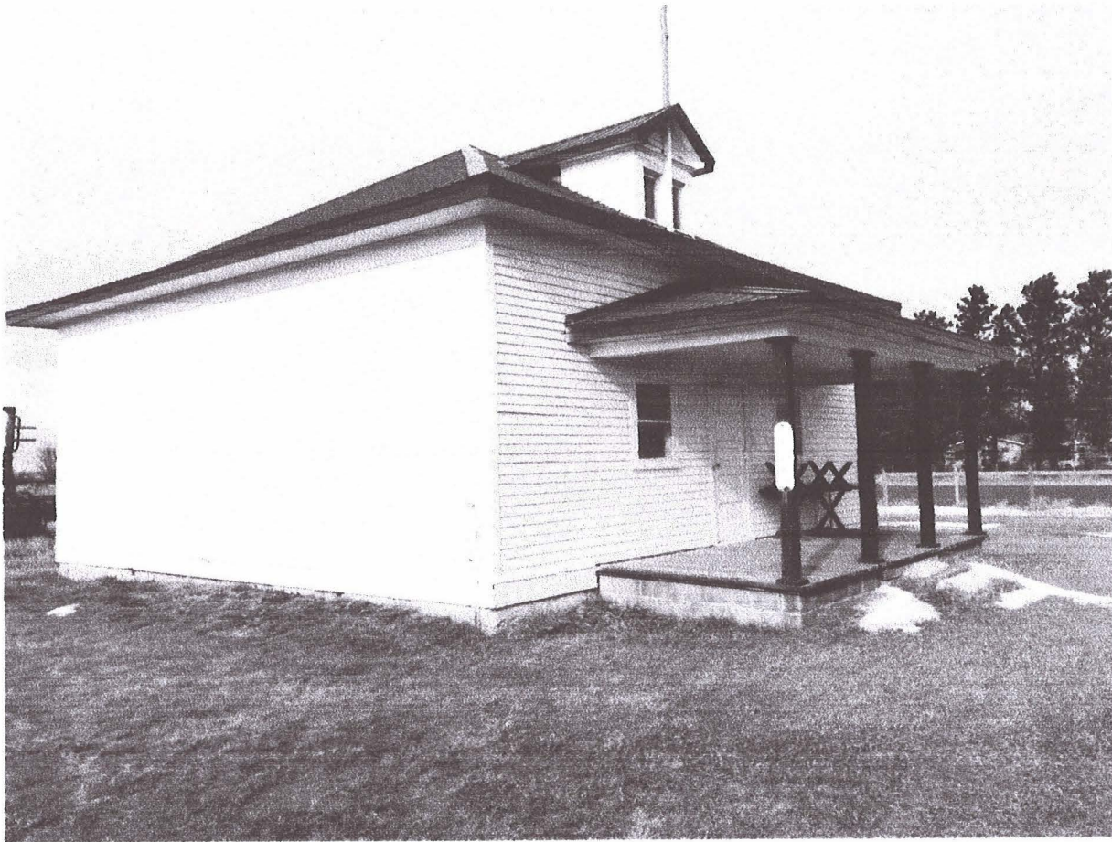
East (porch) South