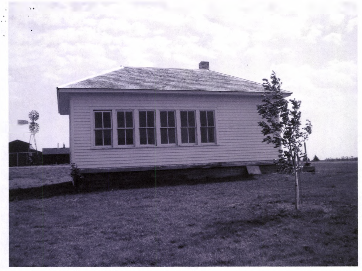
Heritage Park School