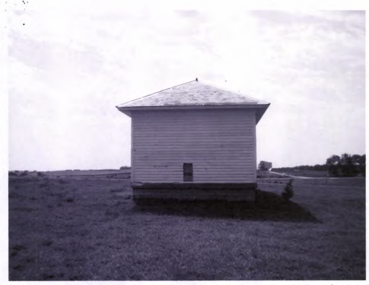
Heritage Park School