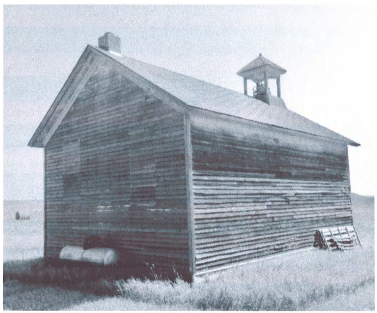
North and West Sides