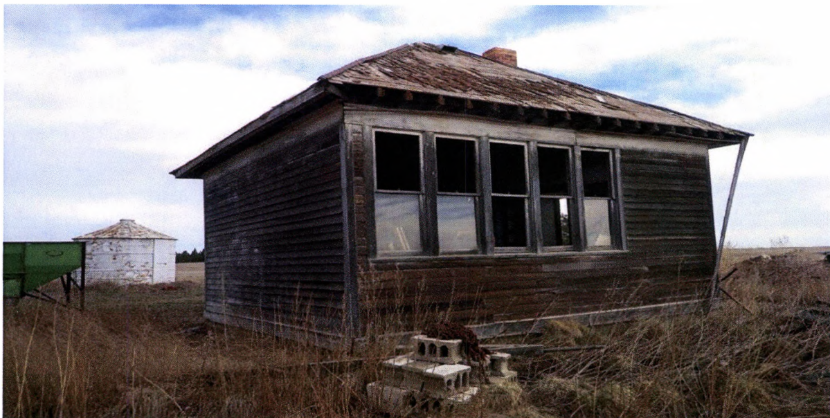
Figure 15: Site 32SKx356, Feature 9, view southeast (Image #2592).