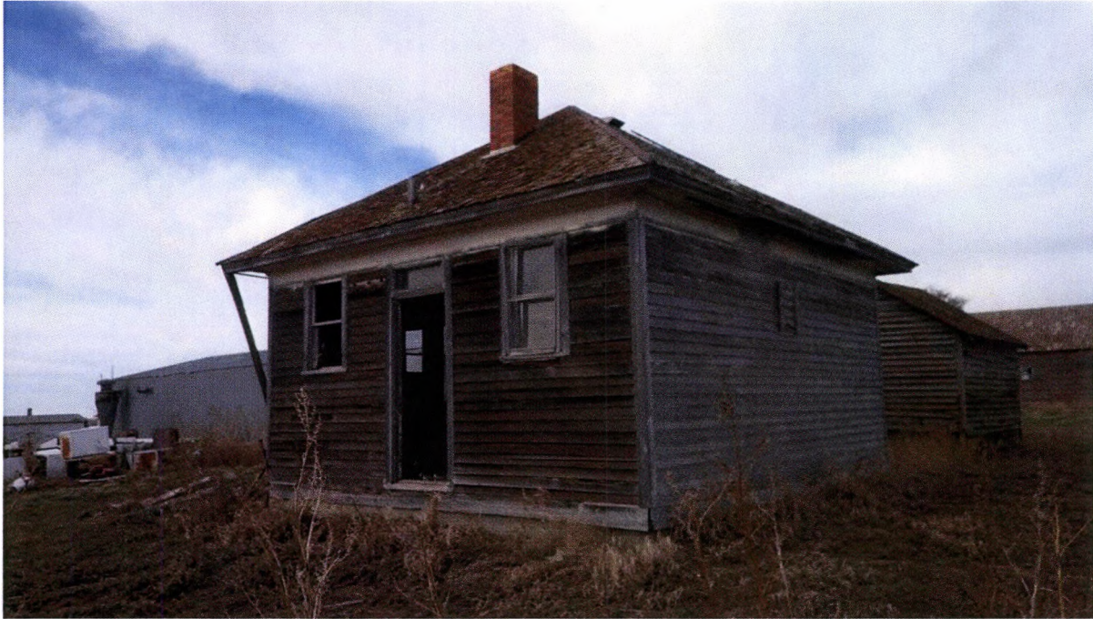
Figure 16: Site 32SKx356, Feature 9, view southwest (Image #2591).