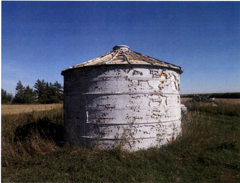
Figure 14: Site 32SKx356, Feature 8, view northeast (Image #0034).