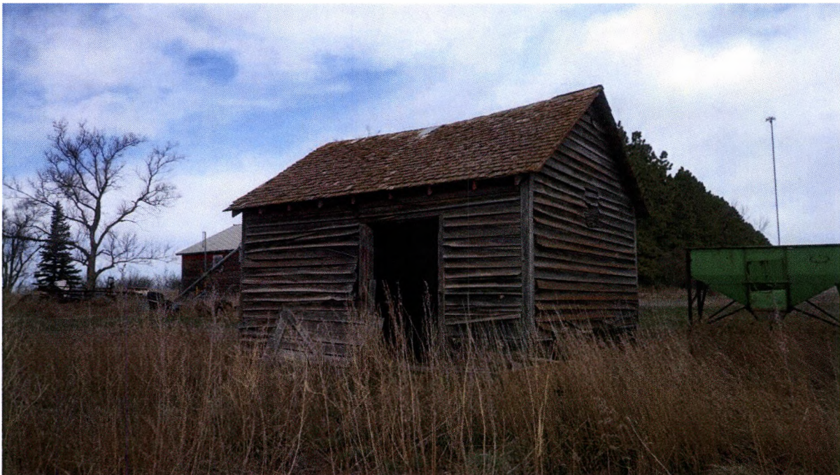
Figure 17: Site 32SKx356, Feature 10, view northwest (Image #2593).