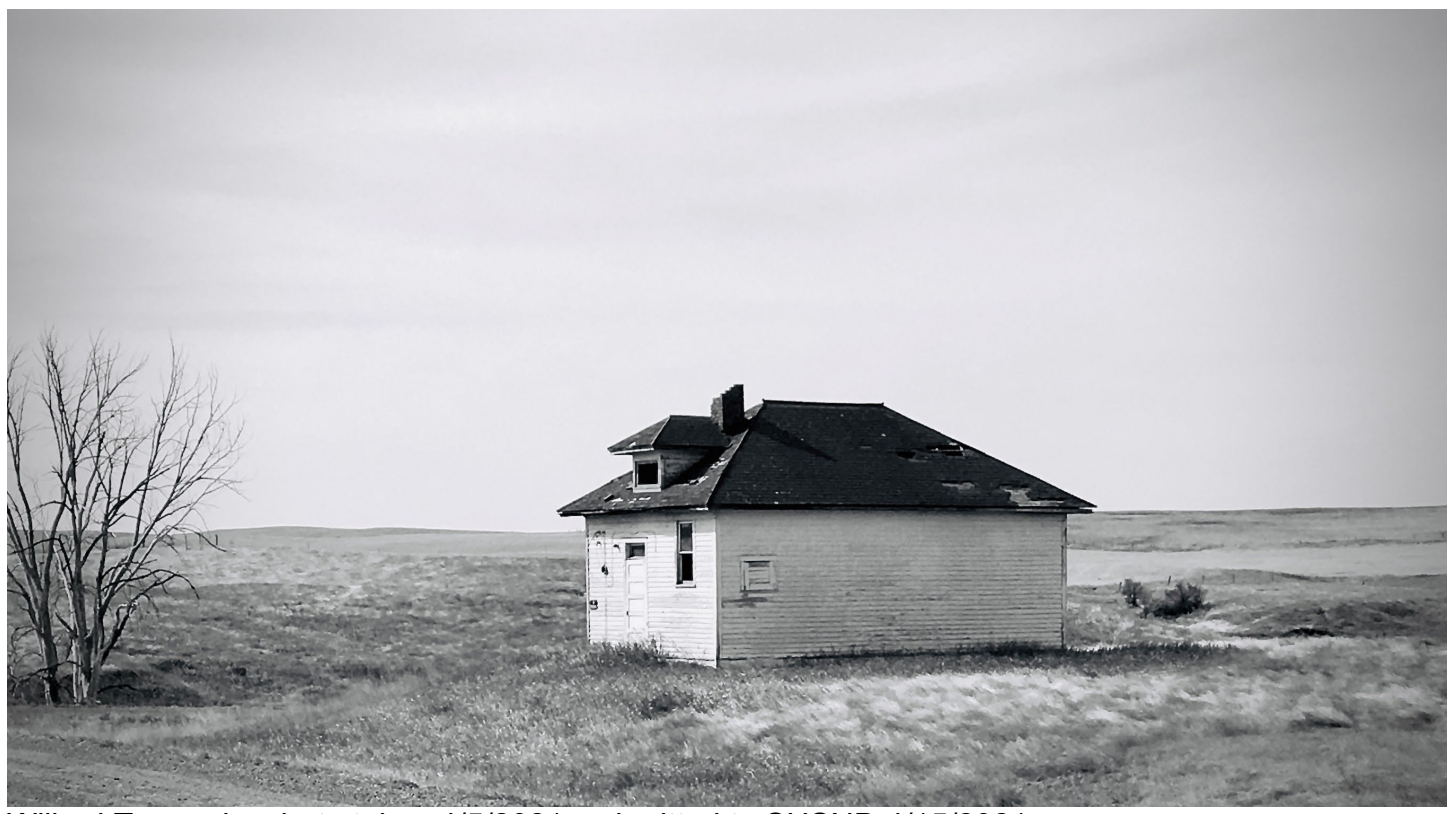
Willard Tormasky photo taken 4/5/2021, submitted to SHSND 4/15/2021

Field Code ______ SITS# 32 ___ SK __1216