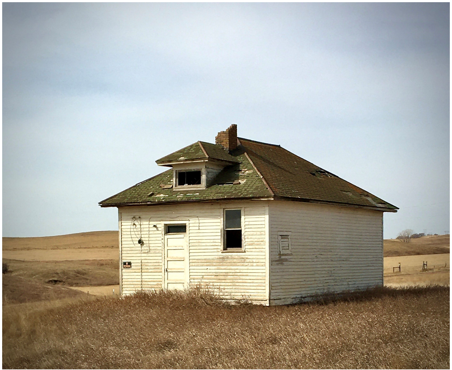
Willard Tormasky photo taken 4/5/2021, submitted to SHSND 4/15/2021

Field Code ______ SITS# 32 ___ SK __1216