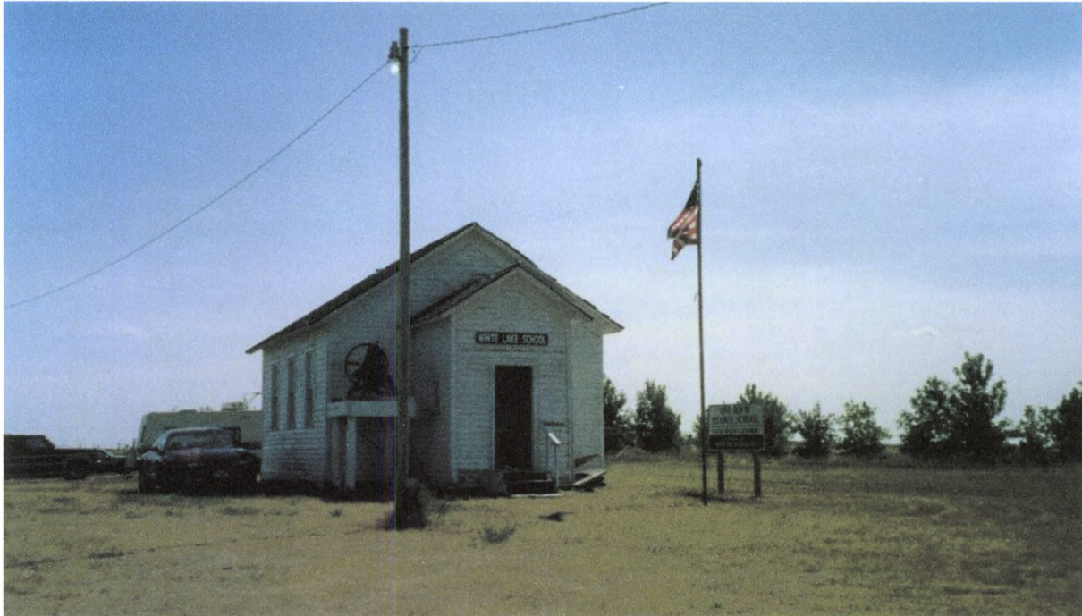
feature 1, WNW