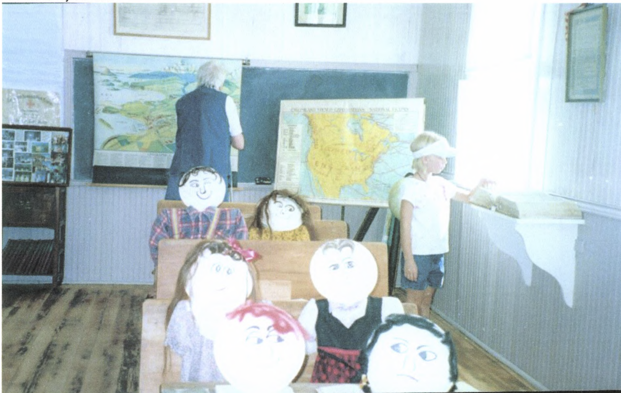
Feature 1 interior

Recorded By Lorna Meidinger (First Name & Last Name)