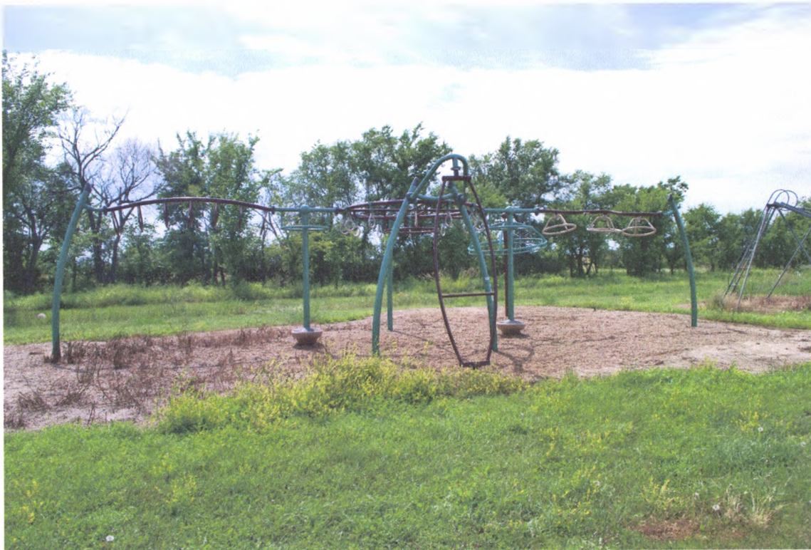
Modern playground equipment