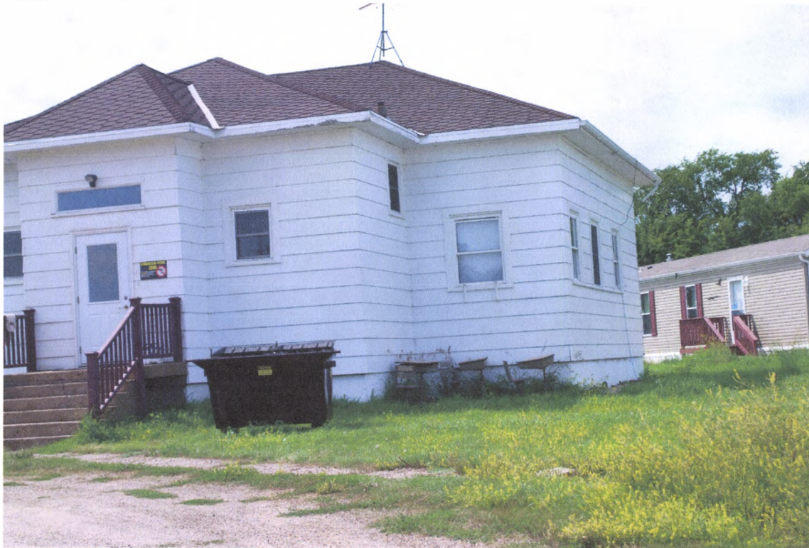
Feature 2 east northeast

Recorded By Lorna Meidinger (First Name & Last Name)