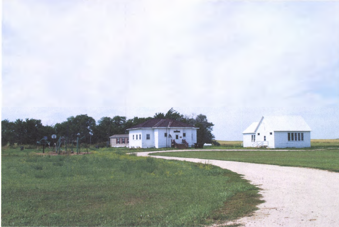
overview from southeast

Complete one Attachments Section for the entire site. Include: Topographic map (with quad name and legal description ), sketch map, photographs, and any other attachments.