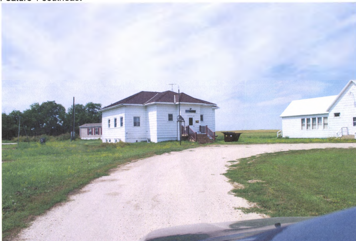
Feature 2 southeast

Recorded By Lorna Meidinger (First Name & Last Name)