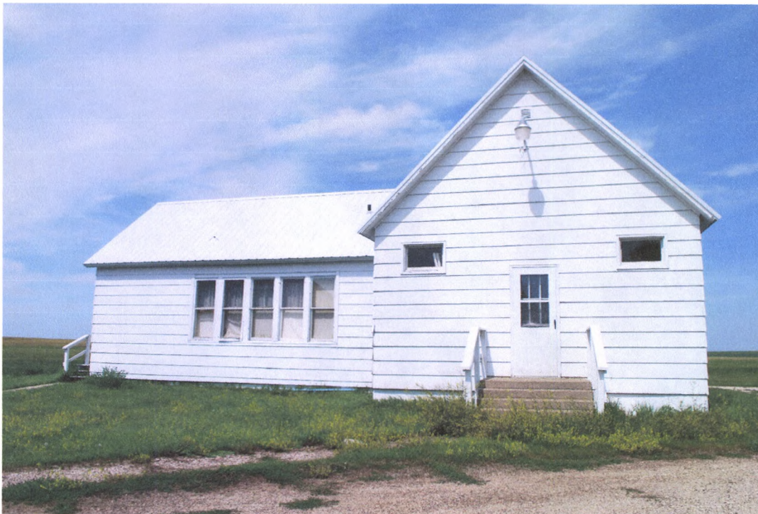
Feature 1 south

Recorded By Lorna Meidinger (First Name & Last Name)