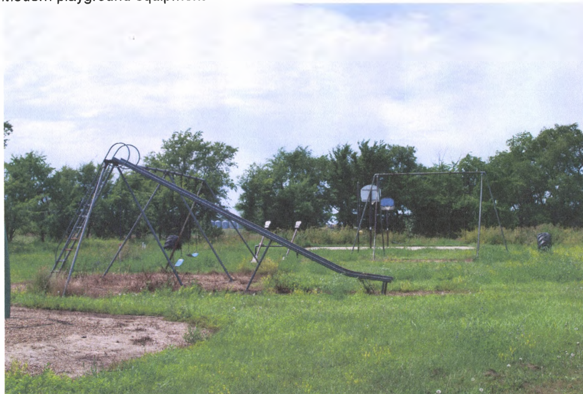
Older playground equipment

Recorded By Lorna Meidinger (First Name & Last Name)