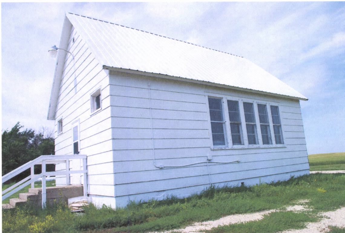
Feature 1 southeast