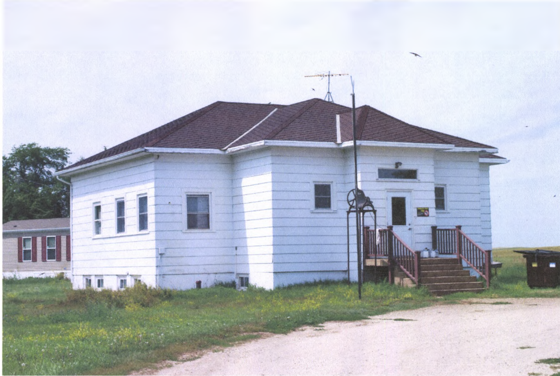
Feature 2 southeast