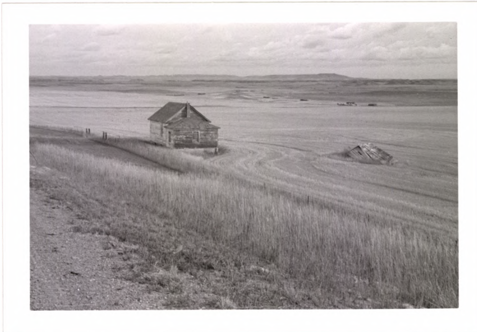
View east-southeast of site (Roll #10/14/96, exposure #14).

This site consists of one standing structure and one collapsed outbuilding. The standing structure is a schoolhouse measuring 12m x 6m. It has an asphalt shingle roof, horizontal wood siding, a brick chimney and a concrete foundation. The foundation is buckling and the exterior is quite weathered, but was painted white at one time. A porch on the east side of the structure has collapsed. The outbuilding is a collapsed, wood-sheathed structure with no evidence of interior walls. Integrity of this site is poor, and this site is probably not significant. Such school houses are common throughout rural North Dakota and many are in better condition. When the telephone cable for which this was recorded is installed, standing structures will be avoided.