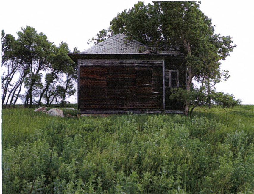
Figure 2. Feature 1, School No. 2, background, Feature 2, foreground, view north.

Recorded By Matt Kinsey, Elizabeth France (First Name & Last Name)