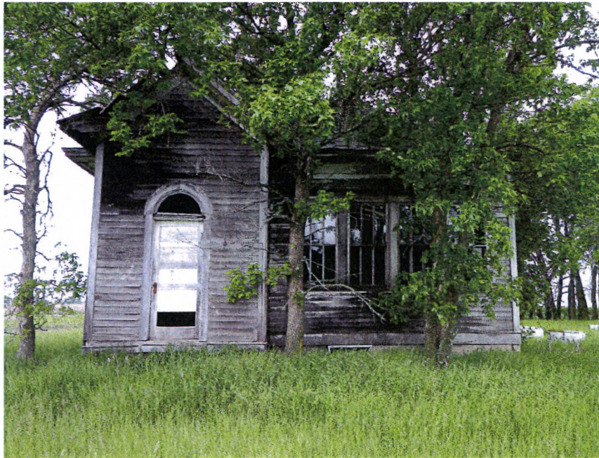
Figure 1. Feature 1, School No. 2, view west.