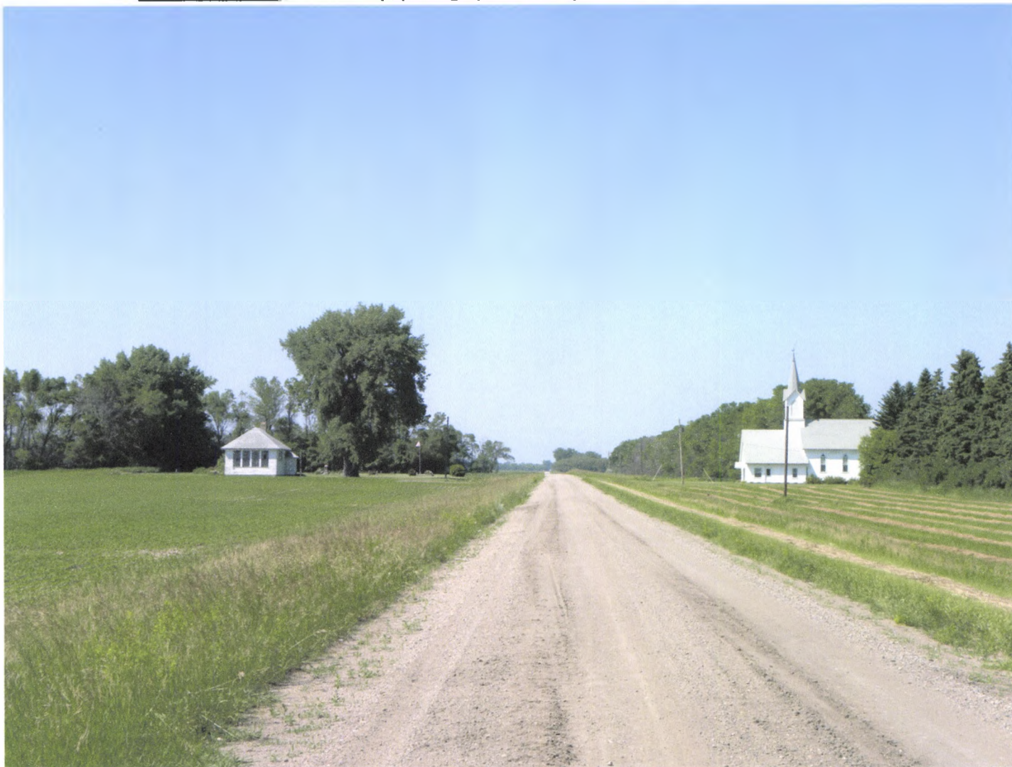
Site as viewed from the south

Complete one Attachments Section for the entire site. Include: Topographic map (with quad name and legal description ), sketch map, photographs, and any other attachments.